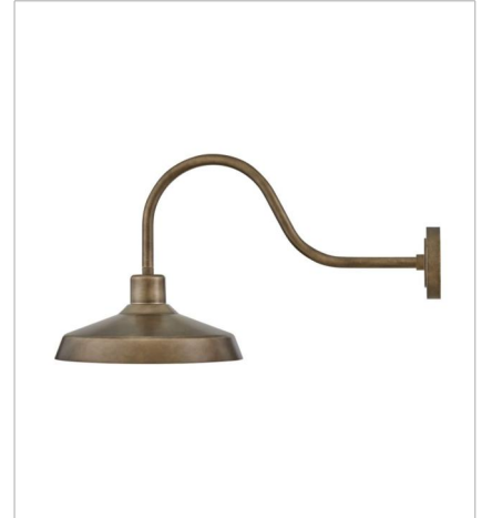
12074BU MEDIUM WALL MOUNT BARN LIGHT 16" W, 17.5" H Socketed 1-14w Med. LED, 100w Equiv.