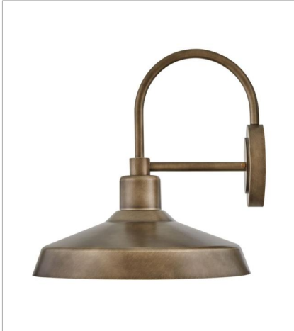
12070BU MEDIUM WALL MOUNT BARN LIGHT 16" W, 16.5" H Socketed 1-14w Med. LED, 100w Equiv.

FINISH: Burnished Bronze SHADE: Composite