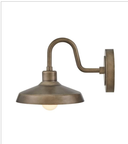
12076BU SMALL WALL MOUNT BARN LIGHT 9.5" W, 9" H Socketed 1-14w Med. LED, 100w Equiv.