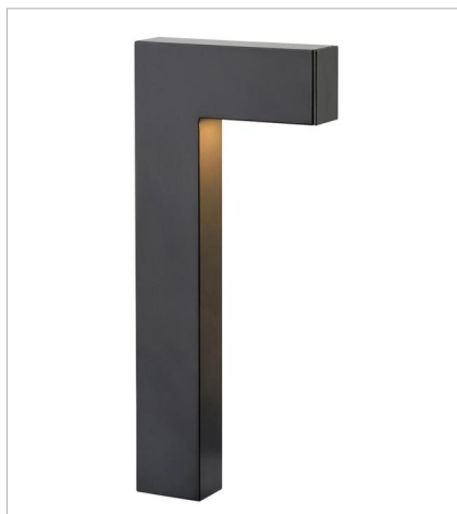
15014SK-LL 12V SMALL LED PATH LIGHT 6.5" W, 15.8" H Socketed 1-1.50w Mini Wedge LED *Included