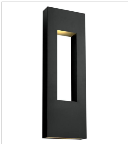
1639SK-LL EXTRA LARGE WALL MOUNT LANTERN 12" W, 36" H Socketed 3-6.50w GU10 LED *Included