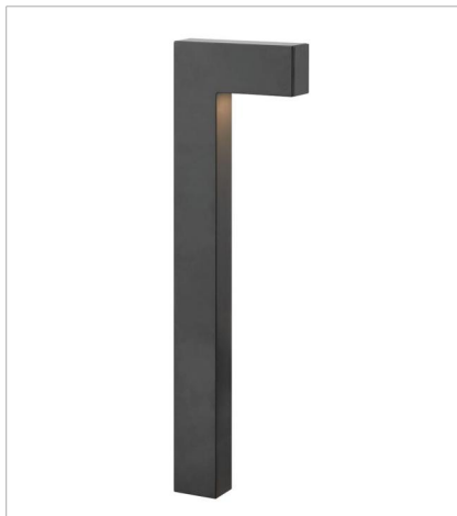
1518SK-LL 12V LARGE LED PATH LIGHT 6.5" W, 22" H Socketed 1-1.50w Mini Wedge LED *Included