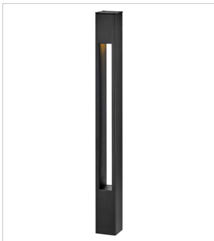
15502SK 12V SMALL SQUARE BOLLARD 2" W, 20" H Socketed 1-4w MR11 LED *Included