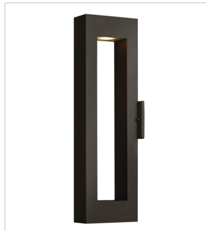
1644SK-LL LARGE WALL MOUNT LANTERN 3" W, 24" H Socketed 2-6w MR16 LED *Included