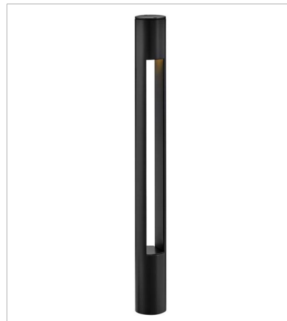
15501SK 12V SMALL ROUND BOLLARD 2" W, 20" H Socketed 1-4w MR11 LED *Included