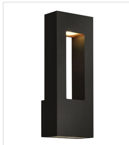
1648SK-LL MEDIUM WALL MOUNT LANTERN 6" W, 16" H Socketed 2-6w MR16 LED *Included