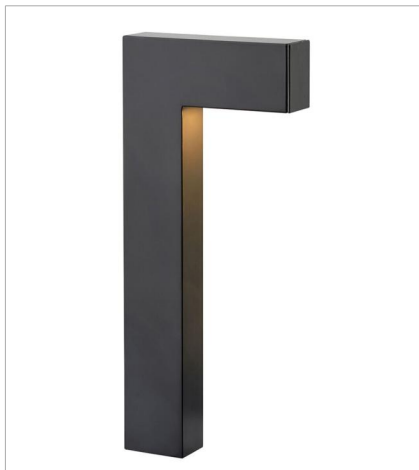
15014SK-LL 12V SMALL LED PATH LIGHT 6.5" W, 15.8" H Socketed 1-1.50w Mini Wedge LED *Included