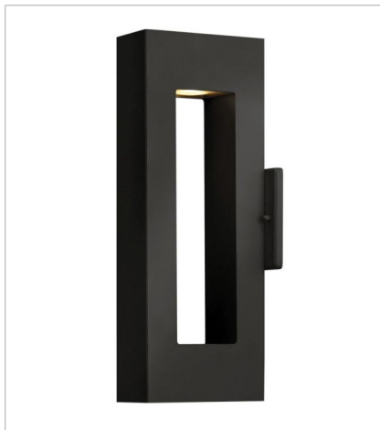
1640SK-LL MEDIUM WALL MOUNT LANTERN 2.8" W, 16" H Socketed 2-6w MR16 LED *Included