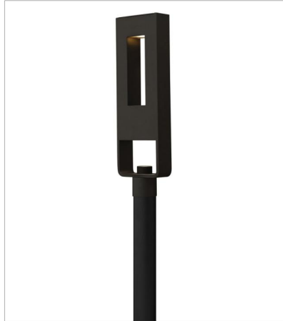
1641SK-LL LARGE POST TOP OR PIER MOUN... 6.8" W, 24.5" H Socketed 2-6w MR16 LED *Included