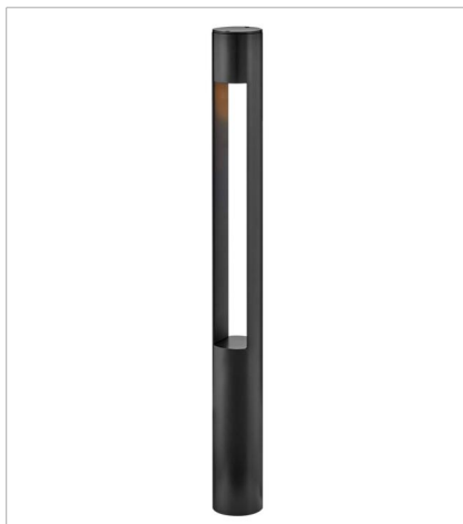
15601SK 12V LARGE ROUND BOLLARD 3" W, 30" H Socketed 1-4w MR16 LED *Included