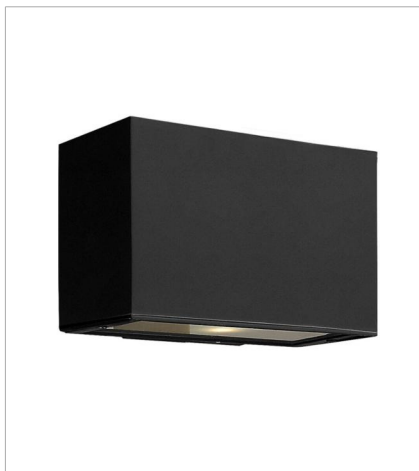
1645SK-LL EXTRA SMALL UP/DOWN WALL MO... 9" W, 6" H Socketed 1-12w Med. LED *Included