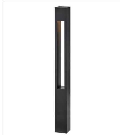
15602SK 12V SQUARE BOLLARD 3" W, 30" H Socketed 1-4w MR16 LED *Included