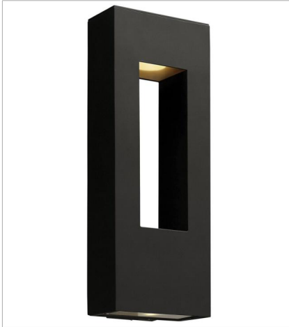
1649SK-LL LARGE WALL MOUNT LANTERN 9" W, 24" H Socketed 2-6.50w GU10 LED *Included