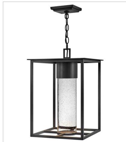
17022BK-LL MEDIUM HANGING LANTERN 12" W, 17.8" H Socketed 1-6.50w GU10 LED *Included