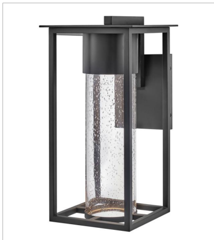
17020BK-LL MEDIUM WALL MOUNT LANTERN 8" W, 16" H Socketed 1-6.50w GU10 LED *Included