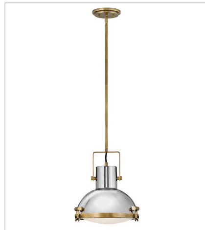
49067HB MEDIUM PENDANT 13" W, 14.5" H Socketed 1-10w Med. LED, 100w Equiv.