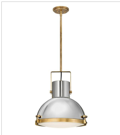
49065HB LARGE PENDANT 18" W, 19" H Socketed 1-12w Med. LED, 100w Equiv.

FINISH: Heritage Brass with Polished Nickel accents, Heritage Brass, Heritage Brass with Heritage Brass accents GLASS: Etched Opal