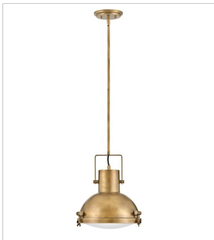
49067HB-HB MEDIUM PENDANT 13" W, 14.5" H Socketed 1-10w Med. LED, 100w Equiv.