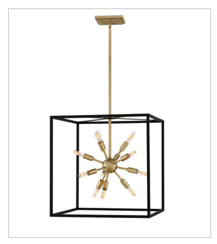
46314BLK MEDIUM OPEN FRAME PENDANT 20" W, 21" H Socketed 12-5w Cand. LED, 40w Equiv.