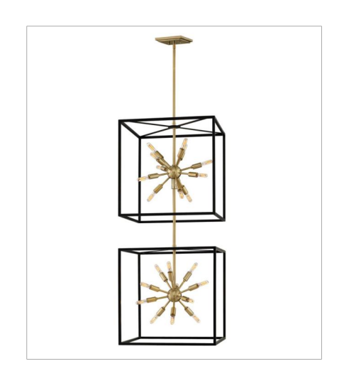
46316BLK LARGE OPEN FRAME TWO TIER 20" W, 51.5" H Socketed 24-5w Cand. LED, 40w Equiv.