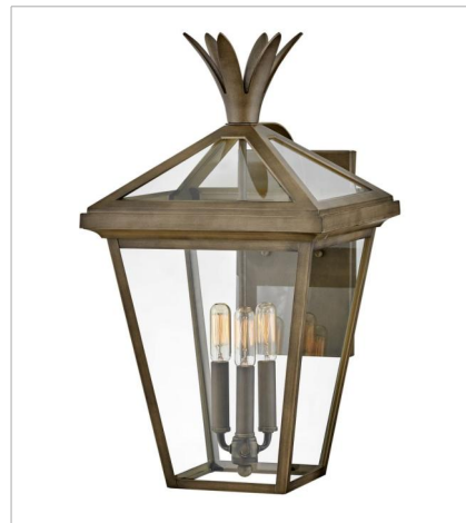
26095BU LARGE WALL MOUNT LANTERN 12" W, 21.5" H Socketed 3-5w Cand. LED, 60w Equiv. or 3-60w Cand.