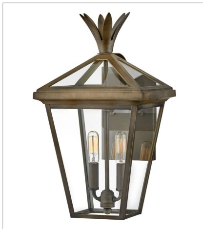
26094BU MEDIUM WALL MOUNT LANTERN 10" W, 18" H Socketed 2-5w Cand. LED, 60w Equiv. or 2-60w Cand.