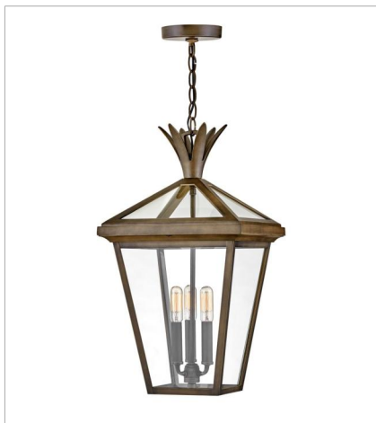
26092BU LARGE HANGING LANTERN 12" W, 21.5" H Socketed 3-5w Cand. LED, 60w Equiv. or 3-60w Cand.