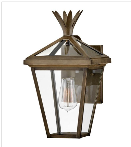
26090BU MEDIUM WALL MOUNT LANTERN 8" W, 14.5" H Socketed 1-10w Med. LED, 100w Equiv. or 1-100w Med.