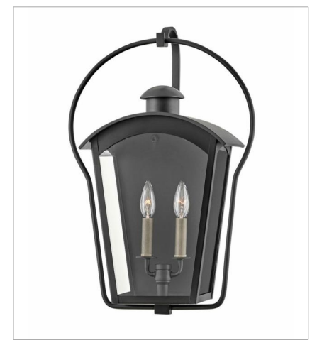
13304BK LARGE WALL MOUNT LANTERN 15" W, 22" H Socketed 2-5w Cand. LED, 60w Equiv.