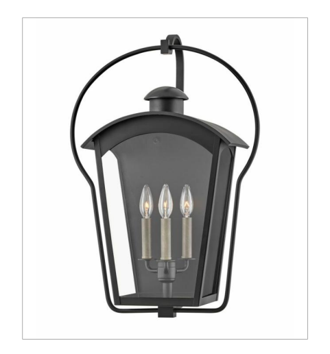
13303BK LARGE WALL MOUNT LANTERN 17" W, 25" H Socketed 3-5w Cand. LED, 60w Equiv.