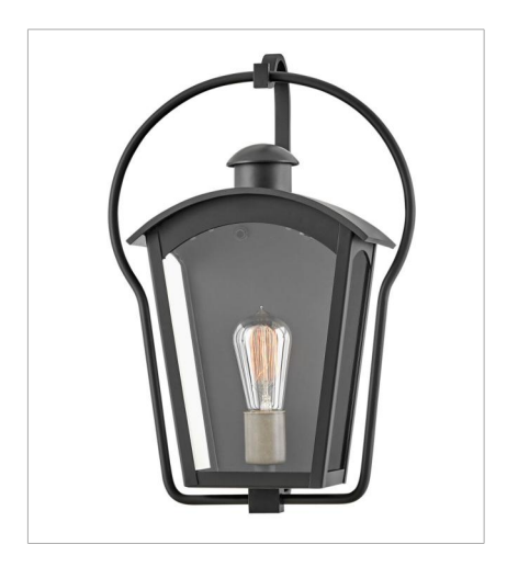
13300BK MEDIUM WALL MOUNT LANTERN 12" W, 17.8" H Socketed 1-12w Med. LED, 100w Equiv.