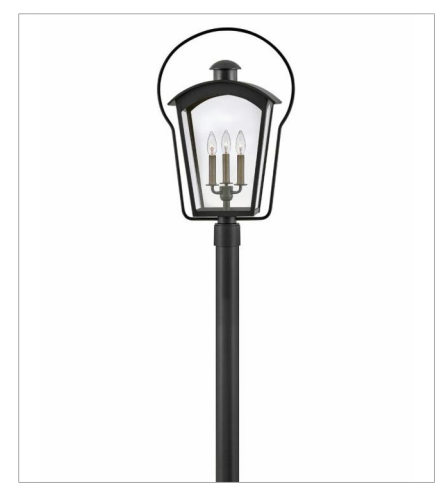
13301BK LARGE POST TOP OR PIER MOUN... 17" W, 26.8" H Socketed 3-5w Cand. LED, 60w Equiv.