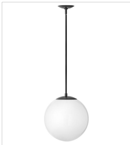
3744BK-WH MEDIUM ORB PENDANT 13.5" W, 14.3" H Socketed 1-12w Med. LED, 100w Equiv.