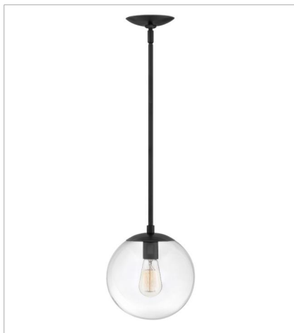
3747BK SMALL PENDANT 9.5" W, 10.8" H Socketed 1-10w Med. LED, 100w Equiv.