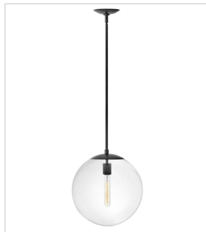
3744BK MEDIUM ORB PENDANT 13.5" W, 14.3" H Socketed 1-12w Med. LED, 100w Equiv.