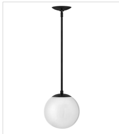
3747BK-WH SMALL PENDANT 9.5" W, 10.8" H Socketed 1-10w Med. LED, 100w Equiv.