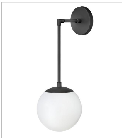
3742BK-WH LARGE SINGLE LIGHT SCONCE 8" W, 21.8" H Socketed 1-10w Med. LED, 100w Equiv.