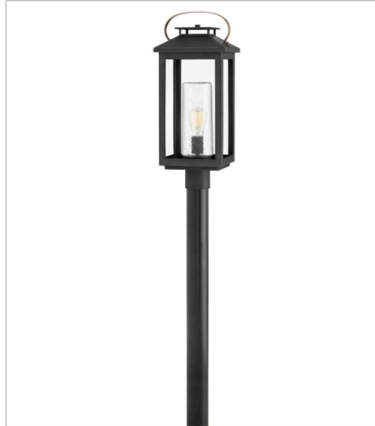
1161BK-LL LARGE POST TOP OR PIER MOUN... 9.5" W, 23" H Socketed 1-2w Med. LED *Included