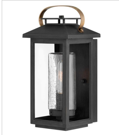
1160BK-LL MEDIUM WALL MOUNT LANTERN 6.5" W, 14" H Socketed 1-2w Med. LED *Included