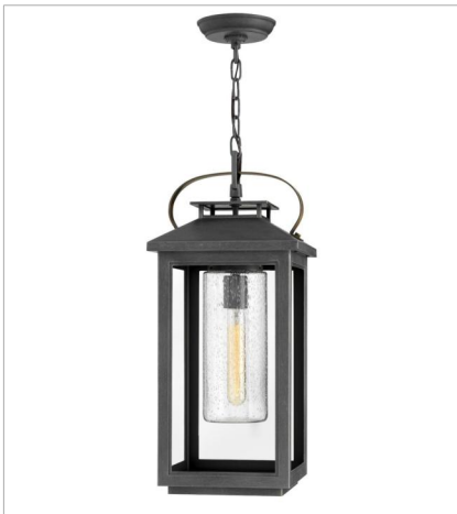
1162AH MEDIUM HANGING LANTERN 9.5" W, 21.5" H Socketed 1-10w Med. LED, 100w Equiv.