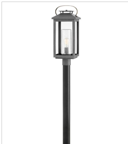
1161AH-LL LARGE POST TOP OR PIER MOUN... 9.5" W, 23" H Socketed 1-5w Med. LED *Included