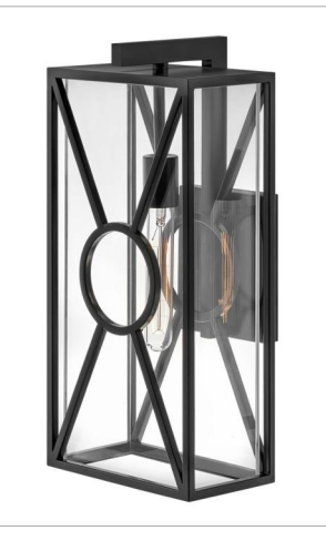
18374BK MEDIUM WALL MOUNT LANTERN 8.8" W, 18.8" H Socketed 1-12w Med. LED, 100w Equiv.

18370BK MEDIUM WALL MOUNT LANTERN 6.8" W, 14" H Socketed 1-12w Med. LED, 100w Equiv.