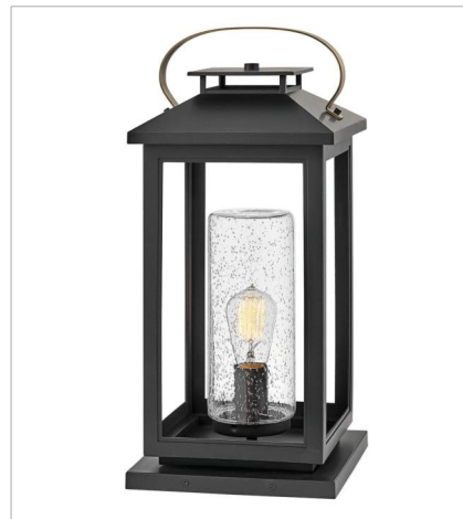
1167BK-LV LARGE PIER MOUNT LANTERN 12V 9.5" W, 21.5" H Socketed 1-3.50w Med. LED *Included