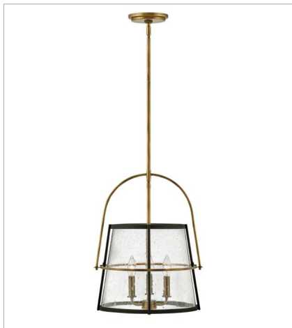
38113HB MEDIUM PENDANT 15" W, 19" H Socketed 3-5w Cand. LED, 60w Equiv.

FINISH: Heritage Brass with Black accents, Heritage Brass, Heritage Brass with Polished White accents GLASS: Clear Seedy