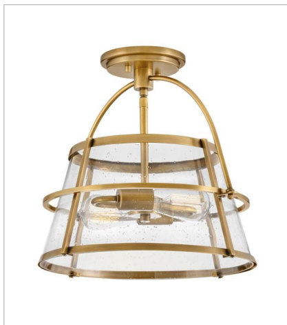
38111HB-HB MEDIUM SEMI-FLUSH MOUNT 15" W, 13.5" H Socketed 2-12w Med. LED, 100w Equiv.