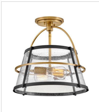
38111HB MEDIUM SEMI-FLUSH MOUNT 15" W, 13.5" H Socketed 2-12w Med. LED, 100w Equiv.