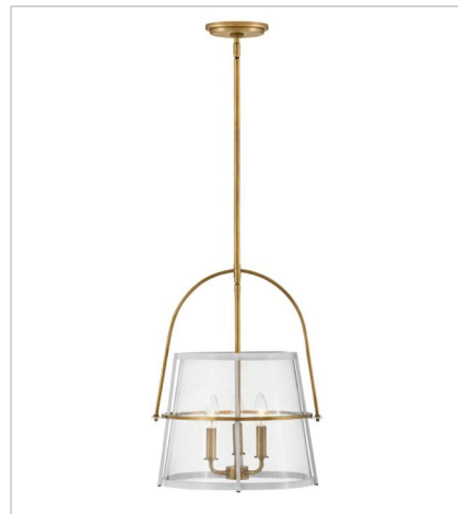
38113HB-PT MEDIUM PENDANT 15" W, 19" H Socketed 3-5w Cand. LED, 60w Equiv.