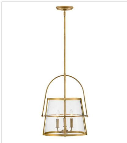
38113HB-HB MEDIUM PENDANT 15" W, 19" H Socketed 3-5w Cand. LED, 60w Equiv.