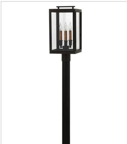
2911OZ LARGE POST TOP OR PIER MOUN... 10" W, 20" H Socketed 3-5w Cand. LED, 60w Equiv.