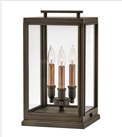
2917OZ LARGE PIER MOUNT LANTERN 10.3" W, 18" H Socketed 3-5w Cand. LED, 60w Equiv.

FINISH: Oil Rubbed Bronze with Antique Copper accents GLASS: Clear