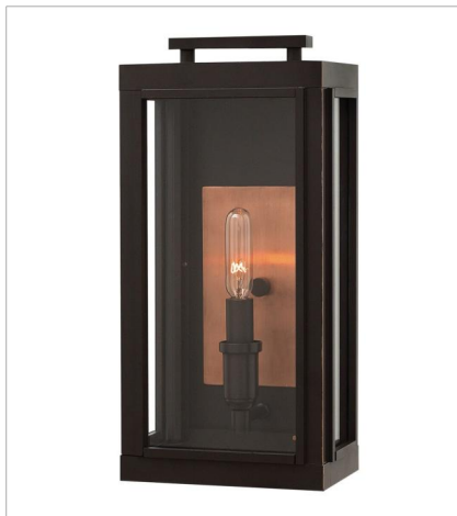
29100Z-LL SMALL WALL MOUNT LANTERN 7" W, 14" H Socketed 1-4w Cand. LED *Included