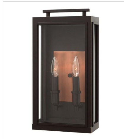
29140Z MEDIUM WALL MOUNT LANTERN 9" W, 17" H Socketed 2-5w Cand. LED, 60w Equiv.