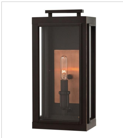
29100Z SMALL WALL MOUNT LANTERN 7" W, 14" H Socketed 1-5w Cand. LED, 60w Equiv.

FINISH: Oil Rubbed Bronze with Antique Copper accents GLASS: Clear