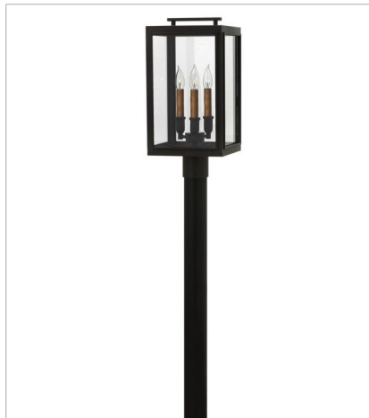
2911OZ-LL LARGE POST TOP OR PIER MOUN... 10" W, 20" H Socketed 3-4w Cand. LED *Included