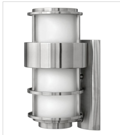
1904SS MEDIUM WALL MOUNT LANTERN 8" W, 16" H Socketed 1-12w Med. LED, 75w Equiv.