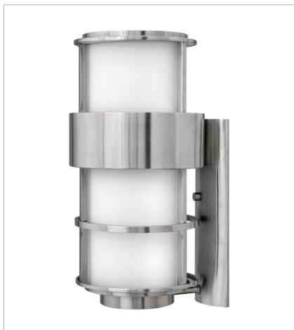
1905SS LARGE WALL MOUNT LANTERN 10" W, 20.3" H Socketed 1-12w Med. LED, 100w Equiv.