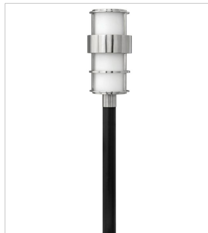
1901SS-LV LARGE POST TOP OR PIER MOUN... 10" W, 21.8" H Socketed 1-3.50w Med. LED *Included