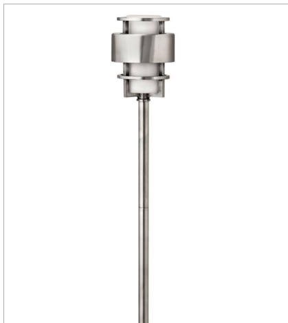
1579SS-LL LED PATH LIGHT 4.5" W, 22.3" H Socketed 1-2.50w T5 LED *Included