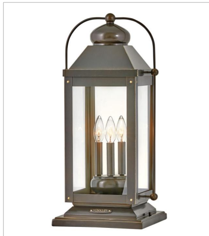
1857LZ LARGE PIER MOUNT LANTERN 11" W, 23.5" H Socketed 3-5w Cand. LED, 60w Equiv.