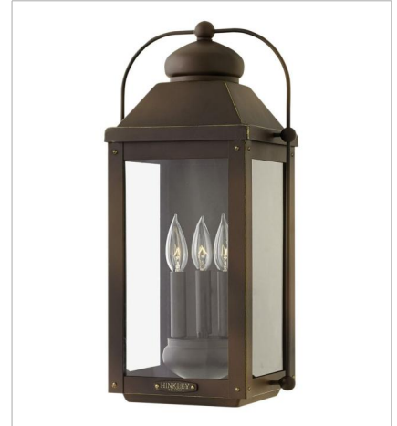
1855LZ LARGE WALL MOUNT LANTERN 11" W, 21.5" H Socketed 3-5w Cand. LED, 60w Equiv.