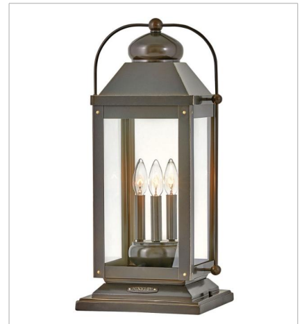
1857LZ-LV LARGE PIER MOUNT LANTERN 12V 11" W, 23.5" H Socketed