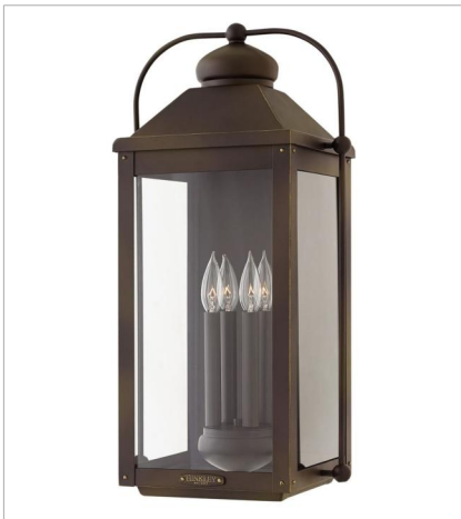
1858LZ EXTRA LARGE WALL MOUNT LANTERN 13" W, 25" H Socketed 4-5w Cand. LED, 60w Equiv.