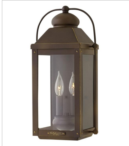
1854LZ MEDIUM WALL MOUNT LANTERN 9.3" W, 17.8" H Socketed 2-5w Cand. LED, 60w Equiv.