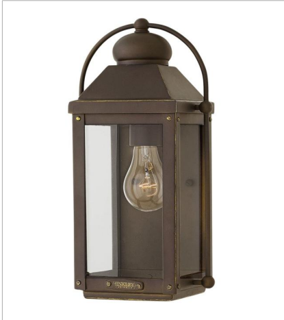
1850LZ SMALL WALL MOUNT LANTERN 7" W, 13" H Socketed 1-12w Med. LED, 100W Equiv.