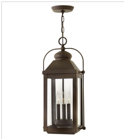
1852LZ LARGE HANGING LANTERN 11" W, 23.8" H Socketed 3-5w Cand. LED, 60w Equiv.