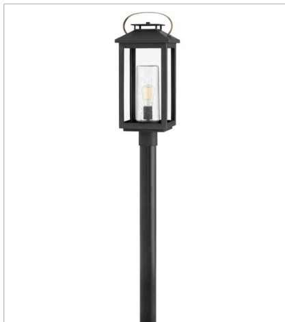
1161BK-LL LARGE POST TOP OR PIER MOUN... 9.5" W, 23" H Socketed 1-5w Med. LED *Included