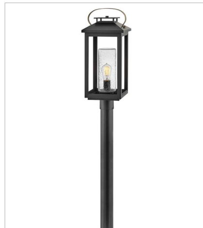
1161BK-LV LARGE POST TOP OR PIER MOUN... 9.5" W, 23" H Socketed 1-3.50w Med. LED *Included