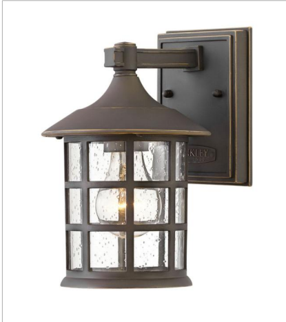
1860OZ SMALL WALL MOUNT LANTERN 6" W, 9.3" H Socketed 1-8w Med. LED, 75w Equiv.

FINISH: Oil Rubbed Bronze GLASS: Clear Seedy