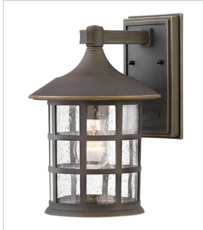
1864OZ MEDIUM WALL MOUNT LANTERN 8" W, 12.3" H Socketed 1-12w Med. LED, 100W Equiv.