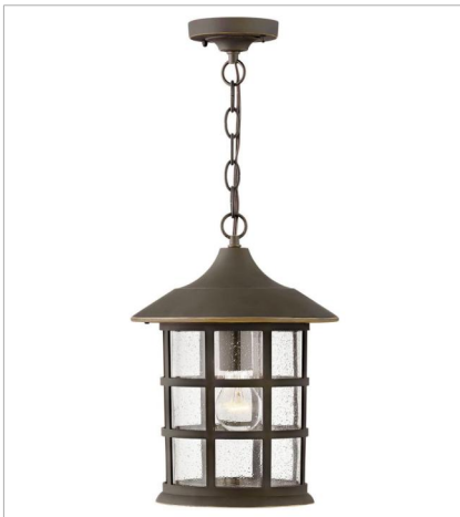
1862OZ LARGE HANGING LANTERN 10" W, 14" H Socketed 1-12w Med. LED, 100W Equiv.