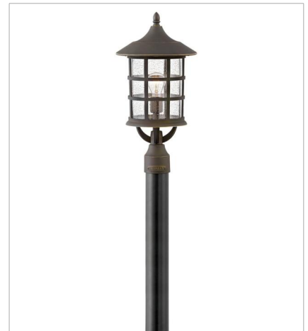
1861OZ-LV MEDIUM POST TOP OR PIER MOU... 8" W, 20.5" H Socketed