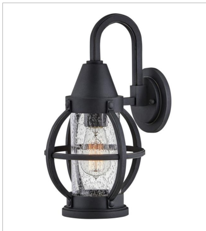
21004MB MEDIUM WALL MOUNT LANTERN 8.3" W, 15" H Socketed 1-10w Med. LED, 60w Equiv.