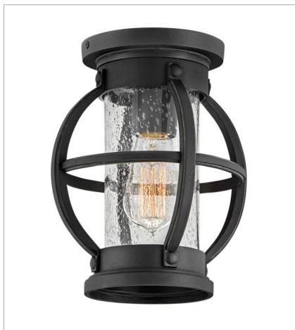
21003MB EXTRA SMALL FLUSH MOUNT 8.3" W, 10" H Socketed 1-10w Med. LED, 60w Equiv.