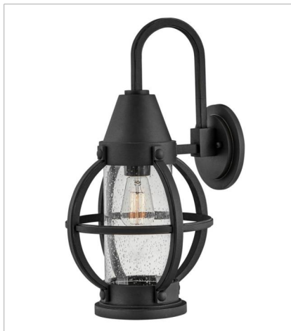
21005MB MEDIUM WALL MOUNT LANTERN 10.5" W, 20" H Socketed 1-10w Med. LED, 60w Equiv.