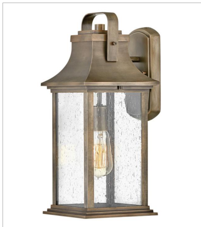
2394BU MEDIUM WALL MOUNT LANTERN 7.3" W, 16.8" H Socketed 1-12w Med. LED, 100w Equiv.