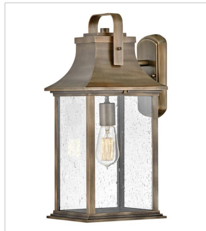
2395BU LARGE WALL MOUNT LANTERN 8.5" W, 19" H Socketed 1-12w Med. LED, 100w Equiv.