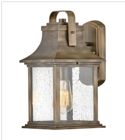
2390BU SMALL WALL MOUNT LANTERN 7.3" W, 13.8" H Socketed 1-12w Med. LED, 100w Equiv.

FINISH: Burnished Bronze GLASS: Clear Seedy