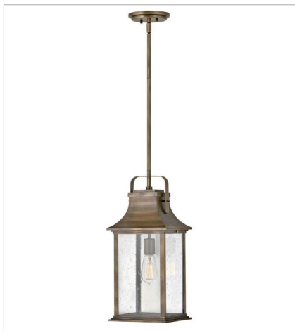
2392BU MEDIUM HANGING LANTERN 8.5" W, 19.8" H Socketed 1-12w Med. LED, 100w Equiv.