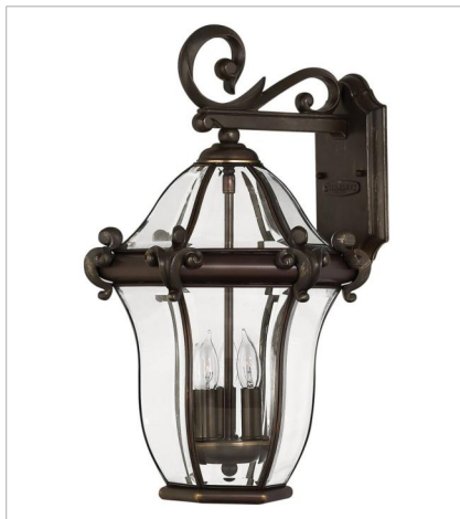
2444CB MEDIUM WALL MOUNT LANTERN 12.3" W, 19.8" H Socketed 3-5w Cand. LED, 40w Equiv.