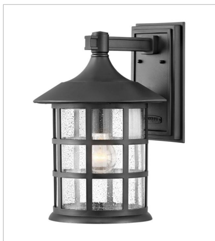
1865TK LARGE WALL MOUNT LANTERN 10" W, 15.3" H Socketed 1-12w Med. LED, 100w Equiv.