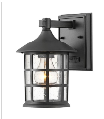
1860TK SMALL WALL MOUNT LANTERN 6" W, 9.3" H Socketed 1-8w Med. LED, 75w Equiv.