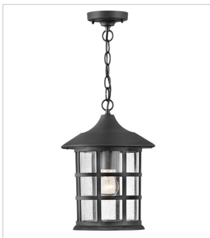
1862TK LARGE HANGING LANTERN 10" W, 14" H Socketed 1-12w Med. LED, 100w Equiv.