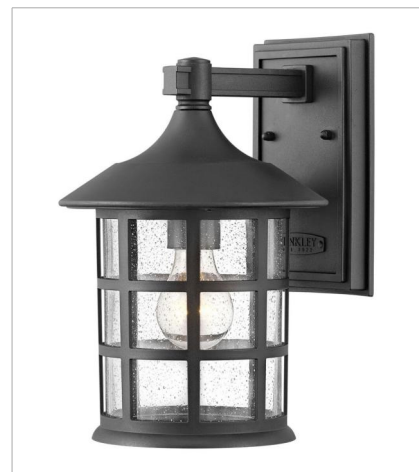
1864TK MEDIUM WALL MOUNT LANTERN 8" W, 12.3" H Socketed 1-12w Med. LED, 100w Equiv.