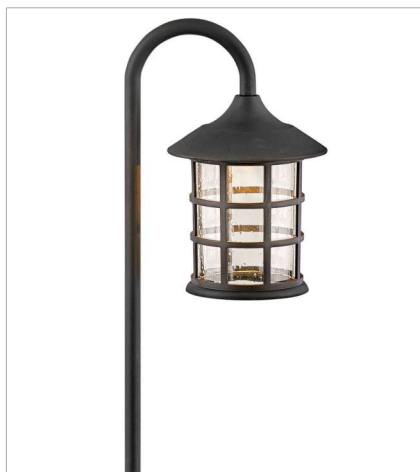
15030TK-LL 12V LED PATH LIGHT 6.3" W, 18" H Socketed 1-1.50w T5 LED *Included

FINISH: Textured Black GLASS: Clear Seedy