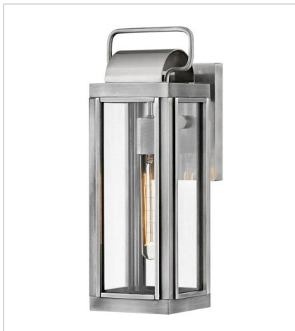
2840AL SMALL WALL MOUNT LANTERN 5.5" W, 16.3" H Socketed 1-10w Med. LED, 100w Equiv.

FINISH: Antique Brushed Aluminum GLASS: Clear