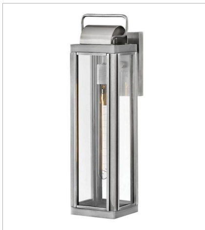
2845AL LARGE WALL MOUNT LANTERN 5.5" W, 21.3" H Socketed 1-10w Med. LED, 100w Equiv.