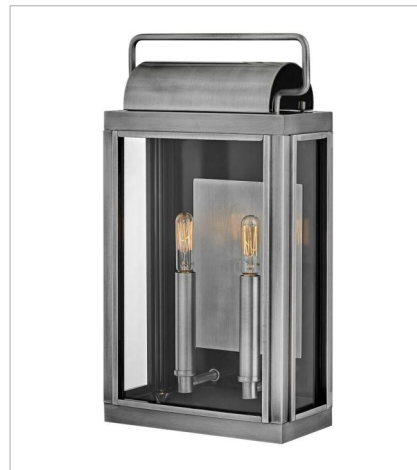
2844AL MEDIUM WALL MOUNT LANTERN 9" W, 16.5" H Socketed 2-5w Cand. LED, 60w Equiv.