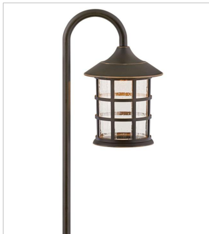
150300Z-LL 12V LED PATH LIGHT 6.3" W, 18" H Socketed 1-1.50w T5 LED *Included

FINISH: Oil Rubbed Bronze GLASS: Clear Seedy