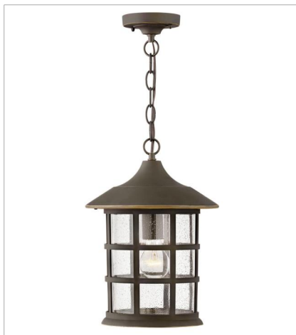
18620Z LARGE HANGING LANTERN 10" W, 14" H Socketed 1-12w Med. LED, 100w Equiv.