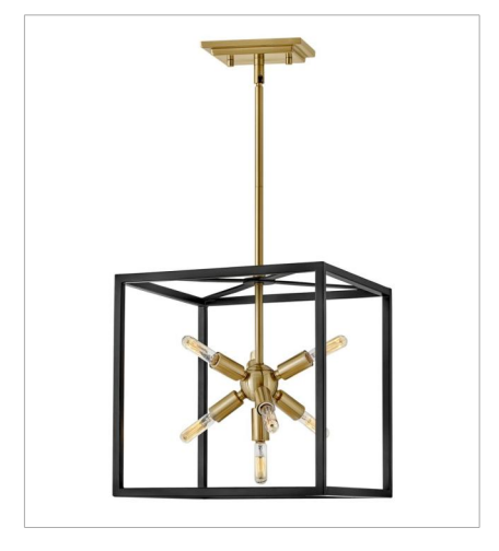
46313BLK MEDIUM CONVERTIBLE PENDANT 13" W, 14" H Socketed 7-5w Cand. LED, 60w Equiv.