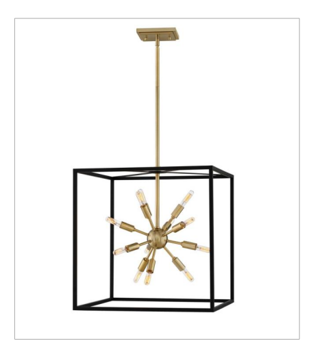
46314BLK MEDIUM OPEN FRAME PENDANT 20" W, 21" H Socketed 12-5w Cand. LED, 40w Equiv.