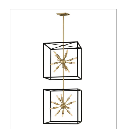
46316BLK LARGE OPEN FRAME TWO TIER 20" W, 51.5" H Socketed 24-5w Cand. LED, 40w Equiv.