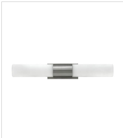
52112BN SMALL LED VANITY 19" W, 4.8" H Integrated LED 16w LED *Included

FINISH: Brushed Nickel GLASS: Etched Opal