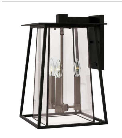
2105BK-LL LARGE WALL MOUNT LANTERN 11.5" W, 17.5" H Socketed 3-4w Cand. LED *Included