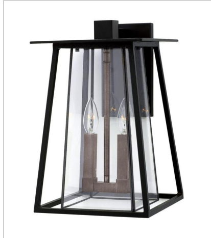
2104BK MEDIUM WALL MOUNT LANTERN 9.5" W, 15" H Socketed 2-5w Cand. LED, 60w Equiv.