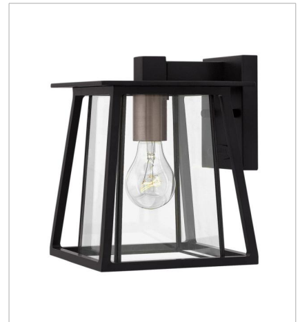
2106BK EXTRA SMALL WALL MOUNT LANTERN 7.3" W, 9.5" H Socketed 1-12w Med. LED, 100w Equiv.