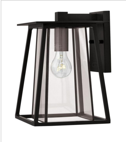
2100BK SMALL WALL MOUNT LANTERN 8.3" W, 12.3" H Socketed 1-12w Med. LED, 100w Equiv.