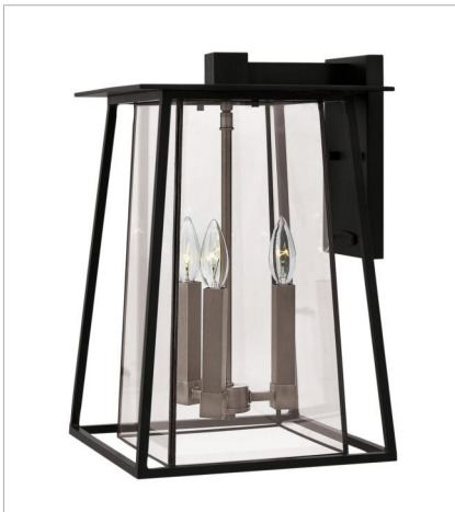
2105BK LARGE WALL MOUNT LANTERN 11.5" W, 17.5" H Socketed 3-5w Cand. LED, 60w Equiv.