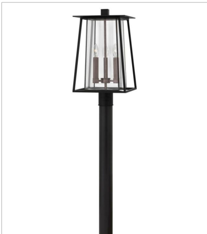
2101BK-LL LARGE POST TOP OR PIER MOUN... 11.3" W, 20.8" H Socketed 3-4w Cand. LED *Included