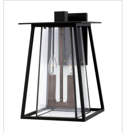
2104BK-LL MEDIUM WALL MOUNT LANTERN 9.5" W, 15" H Socketed 2-4w Cand. LED *Included