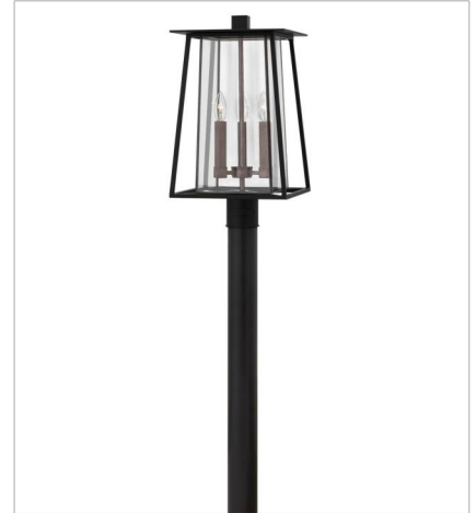
2101BK LARGE POST TOP OR PIER MOUN... 11.3" W, 20.8" H Socketed 3-5w Cand. LED, 60w Equiv.