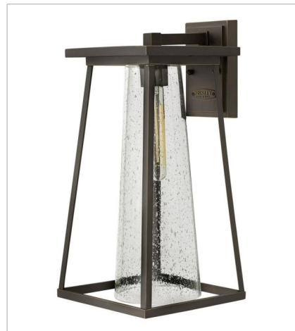
2795OZ-CL LARGE WALL MOUNT LANTERN 10.3" W, 18.5" H Socketed 1-10w Med. LED, 100w Equiv.