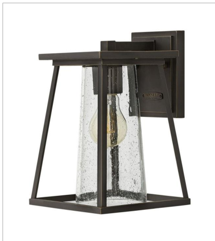
2790OZ-CL SMALL WALL MOUNT LANTERN 7.3" W, 10.8" H Socketed 1-10w Med. LED, 100w Equiv.

FINISH: Oil Rubbed Bronze GLASS: Clear Seedy