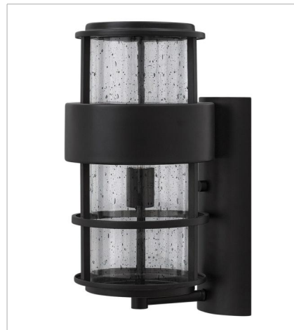
1904SK MEDIUM WALL MOUNT LANTERN 8" W, 16" H Socketed 1-12w Med. LED, 75w Equiv.