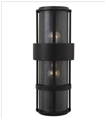
1909SK LARGE WALL MOUNT LANTERN 8" W, 20.5" H Socketed 2-10w Med. LED, 75w Equiv.