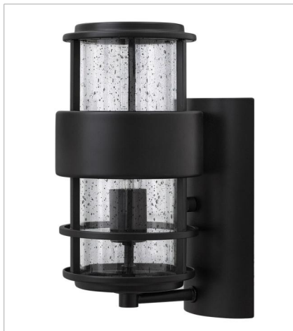
1900SK SMALL WALL MOUNT LANTERN 6" W, 12" H Socketed 1-12w Med. LED, 60w Equiv.