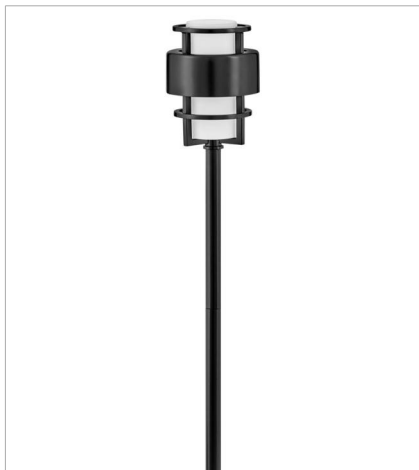
1579SK-LL LED PATH LIGHT 4.5" W, 22.3" H Socketed 1-2.50w T5 LED *Included

FINISH: Satin Black GLASS: Etched Opal, Clear Seedy