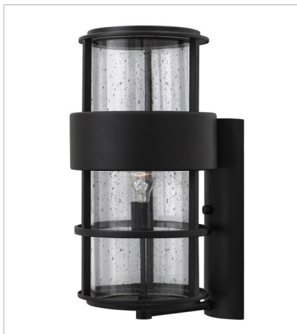
1905SK LARGE WALL MOUNT LANTERN 10" W, 20.3" H Socketed 1-12w Med. LED, 100w Equiv.