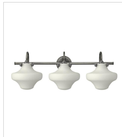
50035AN HURRICANE GLASS THREE LIGHT... 30" W, 11" H Socketed