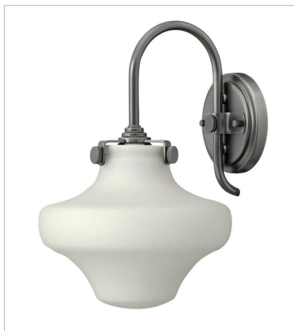
3175AN HURRICANE GLASS SINGLE LIGH... 8.8" W, 13" H Socketed

FINISH: Antique Nickel GLASS: Etched Opal, Clear Seedy