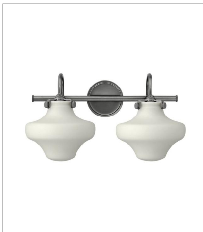
50025AN HURRICANE GLASS TWO LIGHT V... 20" W, 11.5" H Socketed