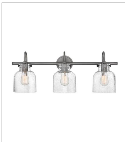
50123AN CYLINDER GLASS THREE LIGHT ... 29.5" W, 11.3" H Socketed 3-12w Med. LED, 100w Equiv.