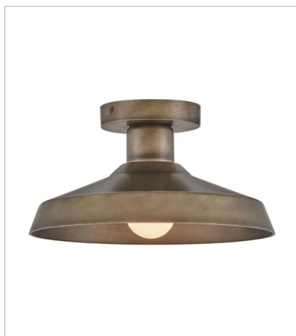
12072BU SMALL FLUSH MOUNT 12" W, 6.5" H Socketed 1-12w Med. LED, 100w Equiv.