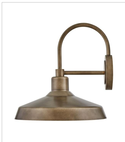
12070BU MEDIUM WALL MOUNT LANTERN 16" W, 16.5" H Socketed 1-14w Med. LED, 100w Equiv.

FINISH: Burnished Bronze SHADE: Composite