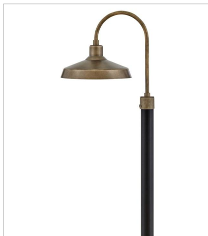
12071BU LARGE POST TOP OR PIER MOUN... 16" W, 22" H Socketed 1-14w Med. LED, 100w Equiv.