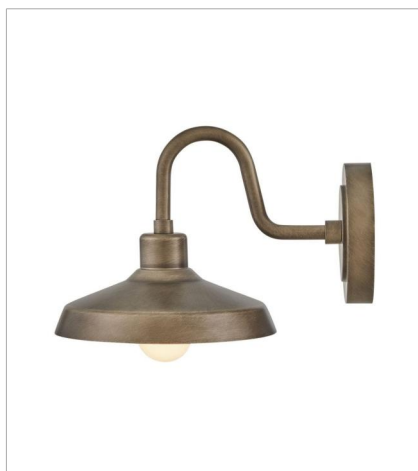
12076BU SMALL WALL MOUNT LANTERN 9.5" W, 9" H Socketed 1-14w Med. LED, 100w Equiv.