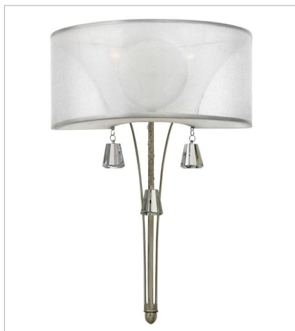
FR45602BNI TWO LIGHT SCONCE 14" W, 20.5" H Socketed 37787

FINISH: Brushed Nickel SHADE: Sheer Translucent Double Hardback