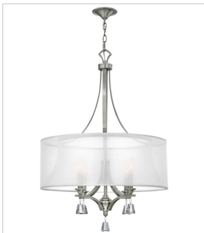
FR45604BNI MEDIUM DRUM 25" W, 36" H Socketed 4-5w Cand. LED, 60w Equiv.