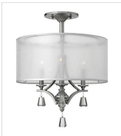
FR45601BNI MEDIUM SEMI-FLUSH MOUNT 17.5" W, 22" H Socketed 3-5w Cand. LED, 60w Equiv.