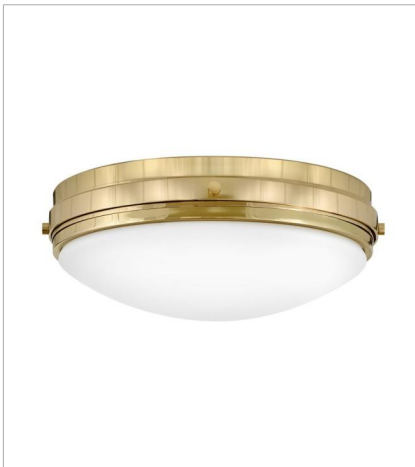
39053BBR MEDIUM FLUSH MOUNT 15.8" W, 5.5" H LED Lamp 3-6w Med. LED, 60w Equiv.