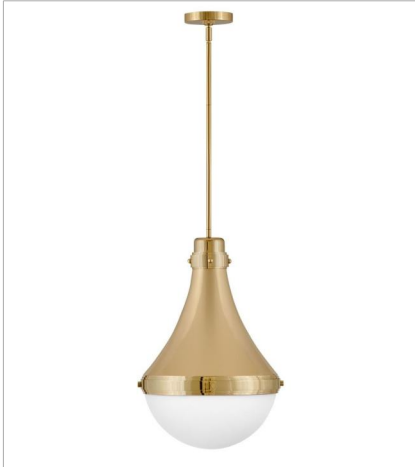
39054BBR MEDIUM PENDANT 14.3" W, 21.3" H LED Lamp 1-12w Med. LED, 100W Equiv.