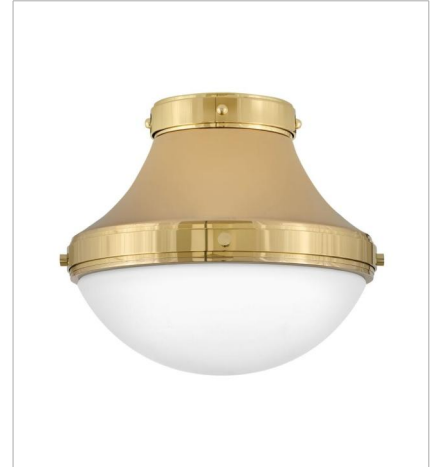
39051BBR SMALL FLUSH MOUNT 14" W, 12" H LED Lamp 1-10w Med. LED, 100w Equiv.