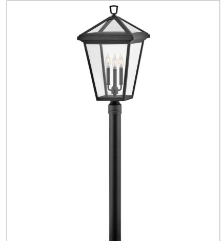
2563MB LARGE POST TOP OR PIER MOUN... 14" W, 26" H Socketed 3-5w Cand. LED, 60w Equiv.