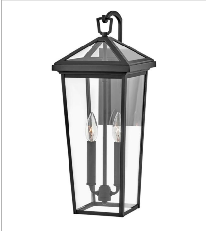
25655MB MEDIUM TALL WALL MOUNT LANTERN 8" W, 20" H Socketed 2-5w Cand. LED, 60w Equiv.

FINISH: Museum Black GLASS: Clear, Clear Seedy