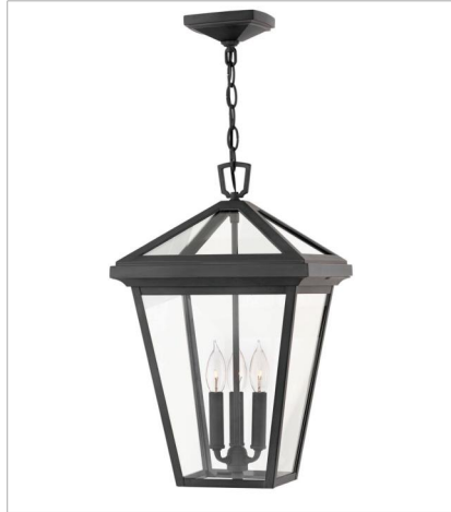
2562MB-LL LARGE HANGING LANTERN 12" W, 19.5" H Socketed 3-4w Cand. LED *Included