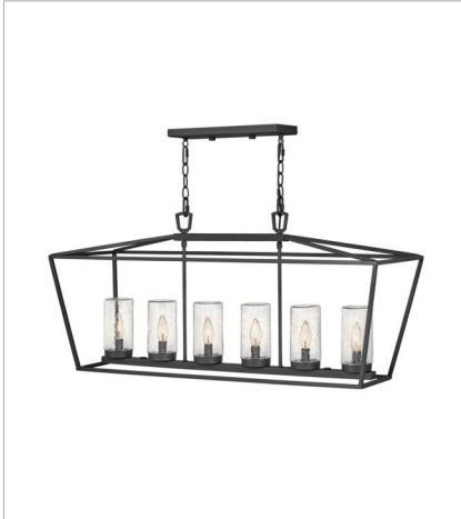
2569MB-LL MEDIUM SIX LIGHT LINEAR 40" W, 18.8" H Socketed 6-4w Cand. LED *Included

FINISH: Museum Black GLASS: Clear, Clear Seedy