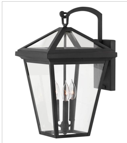
2565MB LARGE WALL MOUNT LANTERN 12" W, 20.5" H Socketed 3-5w Cand. LED, 60w Equiv.