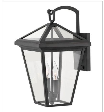
2564MB-LL MEDIUM WALL MOUNT LANTERN 10" W, 17.5" H Socketed 2-4w Cand. LED *Included