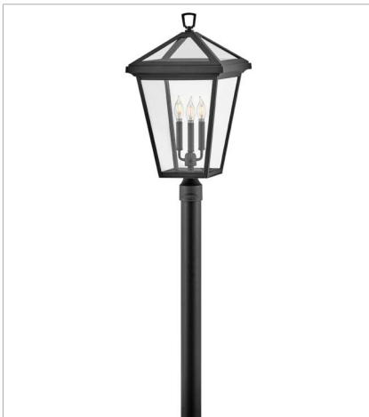
2563MB-LL LARGE POST TOP OR PIER MOUN... 14" W, 26" H Socketed 3-5w Cand. LED *Included, 3 x 30w Equiv.