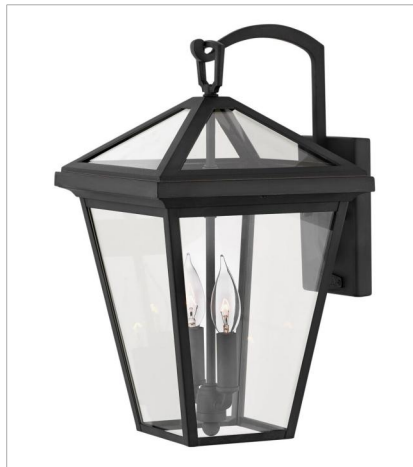
2564MB MEDIUM WALL MOUNT LANTERN 10" W, 17.5" H Socketed 2-5w Cand. LED, 60w Equiv.