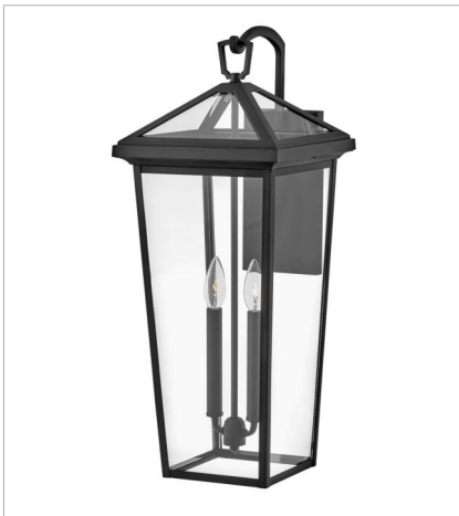
25658MB-LL LARGE TALL WALL MOUNT LANTERN 10" W, 25" H Socketed 2-4w Cand. LED *Included