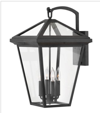
2568MB-LL EXTRA LARGE WALL MOUNT LANTERN 14" W, 24" H Socketed 4-4w Cand. LED *Included