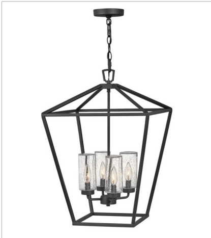
2567MB-LL LARGE SINGLE TIER 17" W, 24.5" H Socketed 4-4w Cand. LED *Included