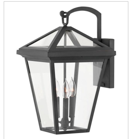
2565MB-LL LARGE WALL MOUNT LANTERN 12" W, 20.5" H Socketed 3-4w Cand. LED *Included