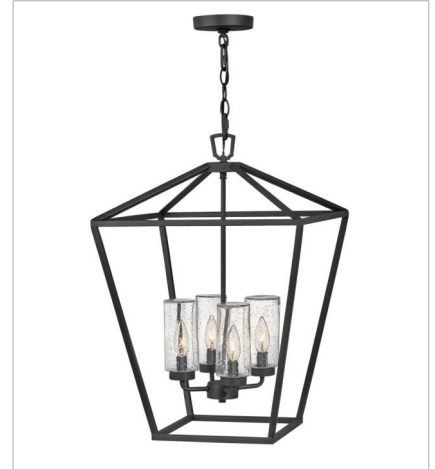
2567MB LARGE SINGLE TIER 17" W, 24.5" H Socketed 4-5w Cand. LED, 60w Equiv.