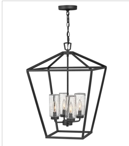
2567MB-LV LARGE SINGLE TIER 12V 17" W, 24.5" H Socketed 4-3.50w Cand. LED *Included