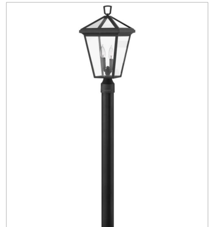
2561MB MEDIUM POST OR PIER MOUNT L... 10" W, 20.3" H Socketed 2-5w Cand. LED, 60w Equiv.