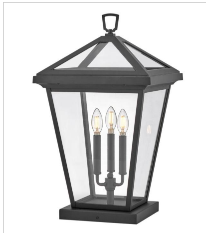
2557MB LARGE PIER MOUNT LANTERN 14" W, 25.8" H Socketed 3-5w Cand. LED, 60w Equiv.