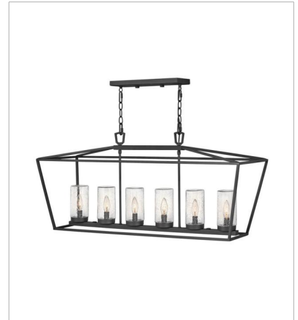
2569MB MEDIUM SIX LIGHT LINEAR 40" W, 18.8" H Socketed 6-5w Cand. LED, 60w Equiv.