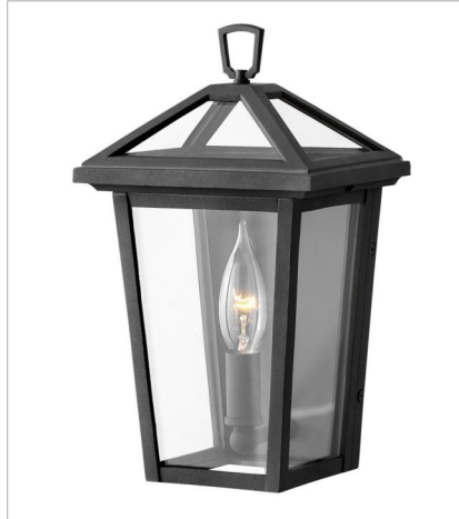
2566MB-LL EXTRA SMALL WALL MOUNT LANTERN 6.5" W, 11.3" H Socketed 1-4w Cand. LED *Included