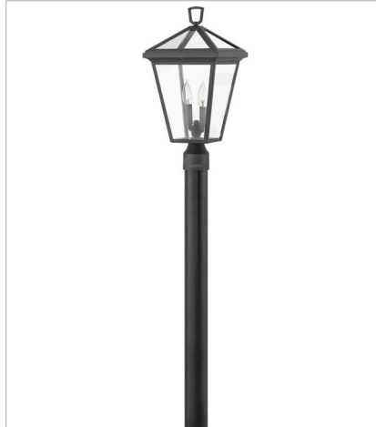
2561MB-LV MEDIUM POST TOP OR PIER MOU... 10" W, 20.3" H Socketed 2-3.50w Cand. LED *Included