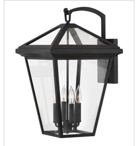
2568MB EXTRA LARGE WALL MOUNT LANTERN 14" W, 24" H Socketed 4-5w Cand. LED, 60w Equiv.