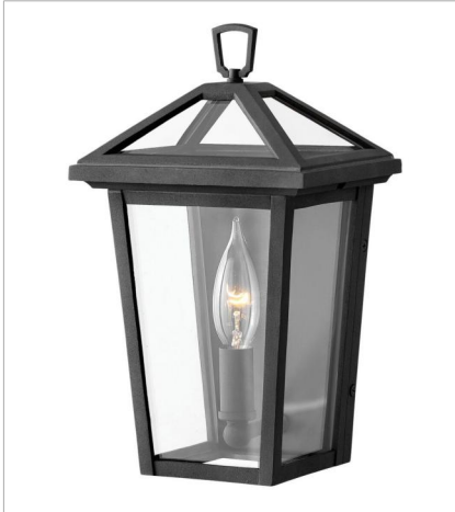
2566MB EXTRA SMALL WALL MOUNT LANTERN 6.5" W, 11.3" H Socketed 1-5w Cand. LED, 60w Equiv.

FINISH: Museum Black GLASS: Clear, Clear Seedy