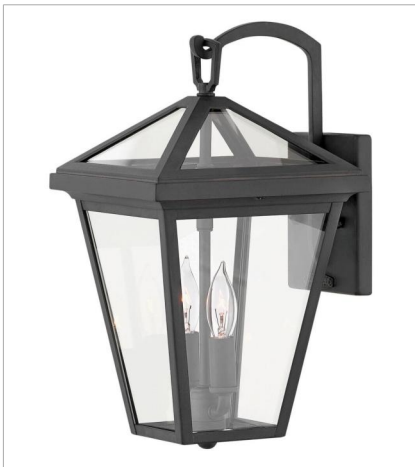
2560MB-LL SMALL WALL MOUNT LANTERN 8" W, 14" H Socketed 2-4w Cand. LED *Included