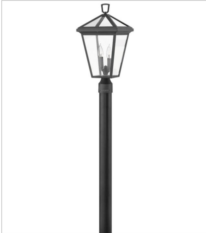
2561MB-LL MEDIUM POST OR PIER MOUNT L... 10" W, 20.3" H Socketed 2-4w Cand. LED *Included

FINISH: Museum Black GLASS: Clear, Clear Seedy