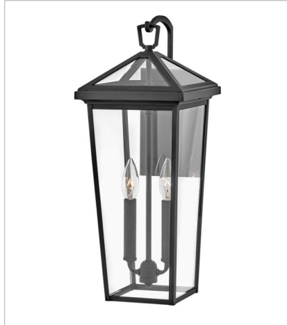
25655MB-LL MEDIUM TALL WALL MOUNT LANTERN 8" W, 20" H Socketed 2-4w Cand. LED *Included