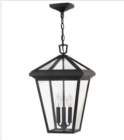
2562MB LARGE HANGING LANTERN 12" W, 19.5" H Socketed 3-5w Cand. LED, 60w Equiv.

FINISH: Museum Black GLASS: Clear, Clear Seedy