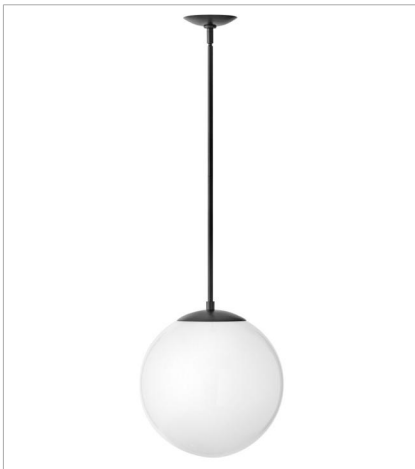
3744BK-WH MEDIUM ORB PENDANT 13.5" W, 14.3" H Socketed 1-12w Med. LED, 100w Equiv.