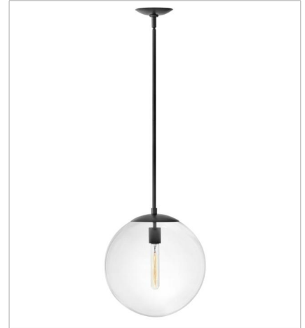
3744BK MEDIUM ORB PENDANT 13.5" W, 14.3" H Socketed 1-12w Med. LED, 100w Equiv.