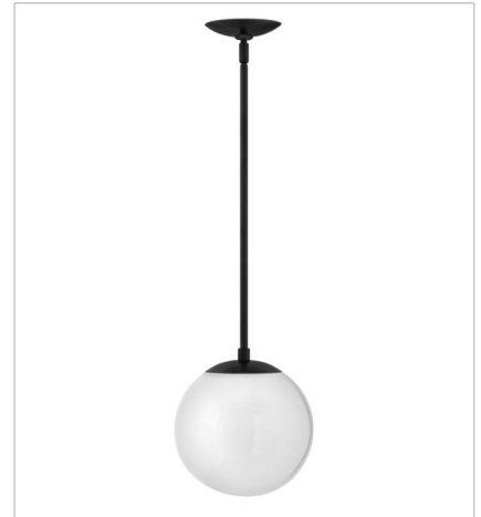
3747BK-WH SMALL PENDANT 9.5" W, 10.8" H Socketed 1-10w Med. LED, 100w Equiv.