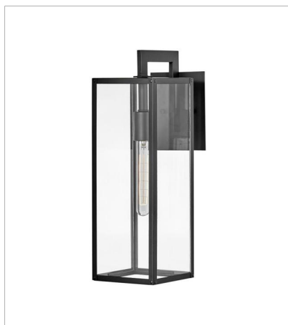
2594BK-LL MEDIUM WALL MOUNT LANTERN 6" W, 18.5" H Socketed 1-2w Med. LED *Included