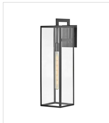
2595BK LARGE WALL MOUNT LANTERN 7" W, 25" H Socketed 1-12w Med. LED, 100w Equiv.