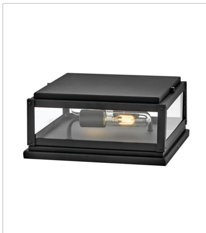
28858BK SMALL PIER MOUNT LANTERN 12" W, 7.5" H Socketed 2-8w Med. LED, 60w Equiv.