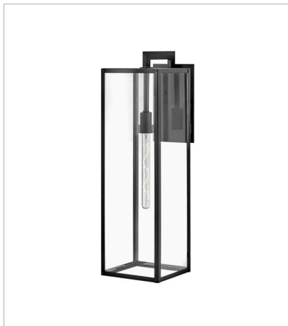
2598BK-LL EXTRA LARGE WALL MOUNT LANTERN 9" W, 31" H Socketed 1-4w Med. LED *Included