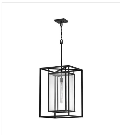
2592BK-LL EXTRA LARGE HANGING LANTERN 16.5" W, 40.8" H Socketed 1-4w Med. LED *Included

FINISH: Black GLASS: Clear, Clear and Etched White (optional)