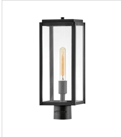
2591BK-LL MEDIUM POST MOUNT LANTERN 7" W, 18.5" H Socketed 1-2w Med. LED *Included