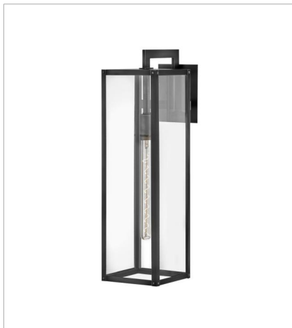
2595BK-LL LARGE WALL MOUNT LANTERN 7" W, 25" H Socketed 1-4w Med. LED *Included

FINISH: Black GLASS: Clear, Clear and Etched White (optional)