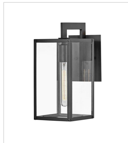
2590BK-LL SMALL WALL MOUNT LANTERN 6" W, 13.3" H Socketed 1-2w Med. LED *Included