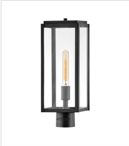
2591BK MEDIUM POST MOUNT LANTERN 7" W, 18.5" H Socketed 1-12w Med. LED, 100w Equiv.

FINISH: Black GLASS: Clear, Clear and Etched White (optional)