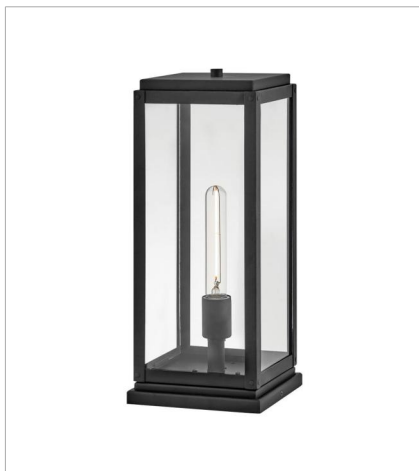
28857BK-LV MEDIUM PIER MOUNT LANTERN 7.3" W, 17" H Socketed 1-3.50w Med. LED *Included