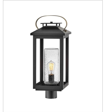
1161BK-LV LARGE POST MOUNT LANTERN 9.5" W, 23" H Socketed 1-3.50w Med. LED *Included