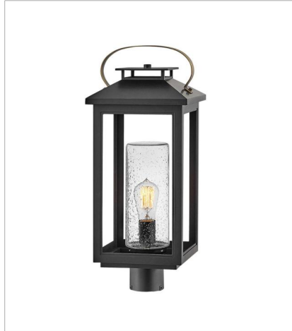
1161BK-LL LARGE POST MOUNT LANTERN 9.5" W, 23" H Socketed 1-2w Med. LED *Included