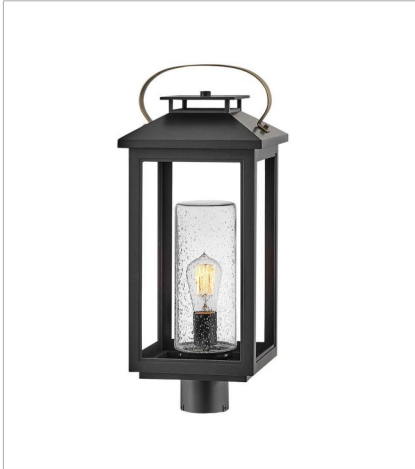
1161BK LARGE POST MOUNT LANTERN 9.5" W, 23" H Socketed 1-10w Med. LED, 100w Equiv.