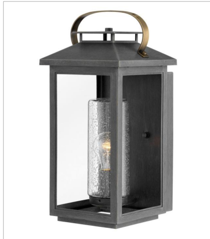
1164AH MEDIUM WALL MOUNT LANTERN 8.3" W, 17.5" H Socketed 1-10w Med. LED, 100w Equiv.