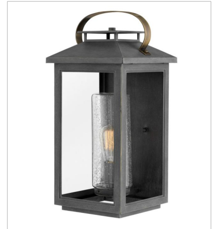
1165AH LARGE OUTDOOR WALL MOUNT LA... 9.5" W, 20.5" H Socketed 1-10w Med. LED, 100w Equiv.