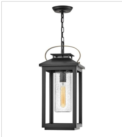
1162BK LARGE HANGING LANTERN 9.5" W, 21.5" H Socketed 1-10w Med. LED, 100w Equiv.