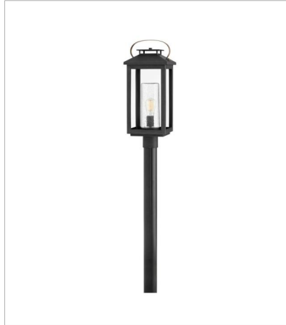
1161BK-LL LARGE POST MOUNT LANTERN 9.5" W, 23" H Socketed 1-2w Med. LED *Included