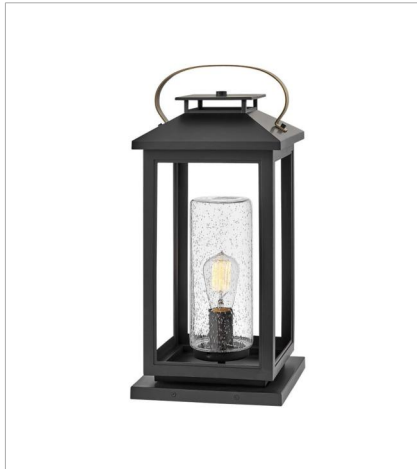
1167BK LARGE PIER MOUNT LANTERN 9.5" W, 21.5" H Socketed 1-10w Med. LED, 100w Equiv.