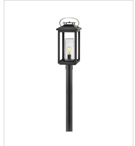
1161BK-LV LARGE POST MOUNT LANTERN 9.5" W, 23" H Socketed 1-3.50w Med. LED *Included