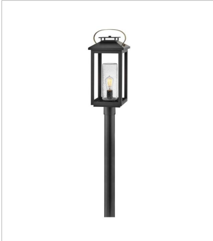
1161BK LARGE POST MOUNT LANTERN 9.5" W, 23" H Socketed 1-10w Med. LED, 100w Equiv.