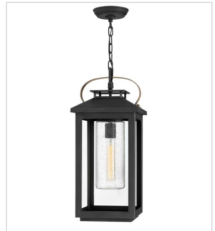
1162BK-LV LARGE HANGING LANTERN 9.5" W, 21.5" H Socketed 1-3.50w Med. LED *Included