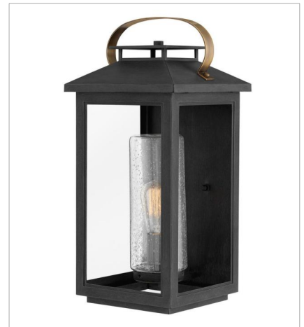
1165BK-LL LARGE WALL MOUNT LANTERN 9.5" W, 20.5" H Socketed 1-2w Med. LED *Included