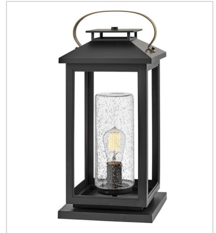
1167BK-LV LARGE PIER MOUNT LANTERN 9.5" W, 21.5" H Socketed 1-3.50w Med. LED *Included