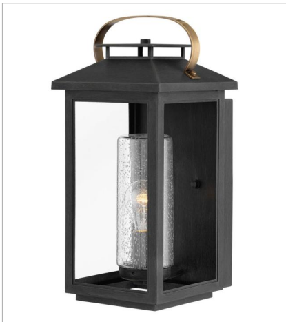
1164BK-LL MEDIUM WALL MOUNT LANTERN 8.3" W, 17.5" H Socketed 1-2w Med. LED *Included