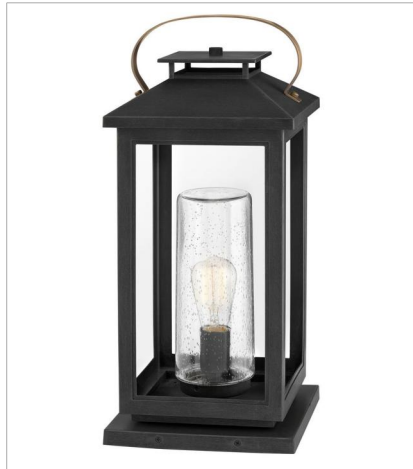
1167BK-LL LARGE PIER MOUNT LANTERN 9.5" W, 21.5" H Socketed 1-2w Med. LED *Included