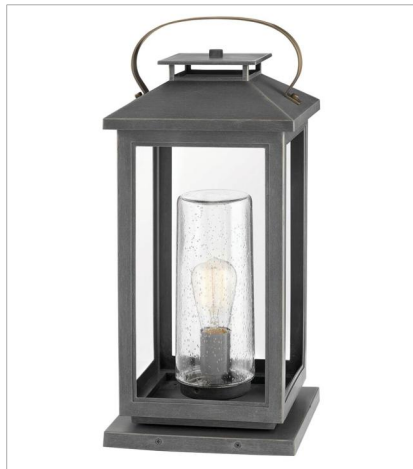
1167AH-LV LARGE PIER MOUNT LANTERN 12V 9.5" W, 21.5" H Socketed 1-3.50w Med. LED *Included