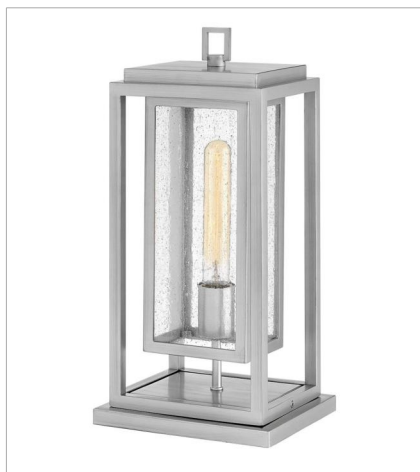
1007SI-LV MEDIUM PIER MOUNT LANTERN 12V 7" W, 16.5" H Socketed