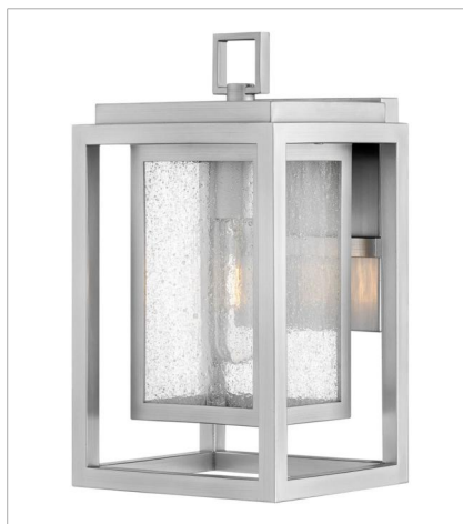
1000SI SMALL WALL MOUNT LANTERN 7" W, 12" H Socketed 1-12w Med. LED, 100W Equiv.