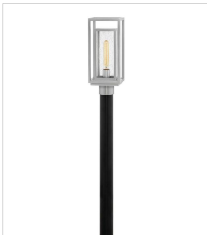
1001SI-LV MEDIUM POST TOP OR PIER MOU... 7" W, 17" H Socketed