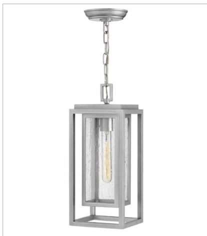
1002SI MEDIUM HANGING LANTERN 7" W, 16.8" H Socketed 1-12w Med. LED, 100W Equiv.