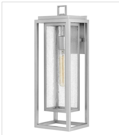
1005SI LARGE OUTDOOR WALL MOUNT LA... 7" W, 20" H Socketed 1-12w Med. LED, 100W Equiv.