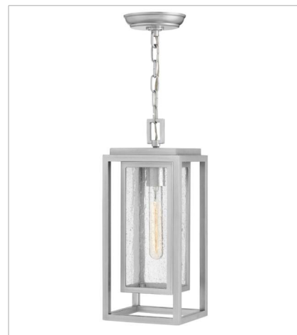
1002SI-LV MEDIUM HANGING LANTERN 12V 7" W, 16.8" H Socketed