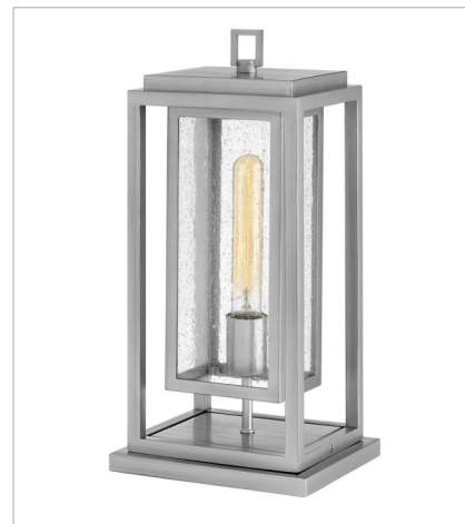
1007SI MEDIUM PIER MOUNT 7" W, 16.5" H Socketed 1-12w Med. LED, 100W Equiv.