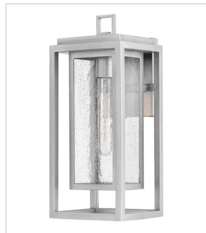
1004SI MEDIUM WALL MOUNT LANTERN 7" W, 16" H Socketed 1-12w Med. LED, 100W Equiv.