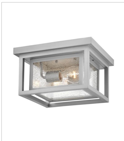
1003SI SMALL FLUSH MOUNT 11" W, 6.5" H Socketed 2-8w Med. LED, 60w Equiv.