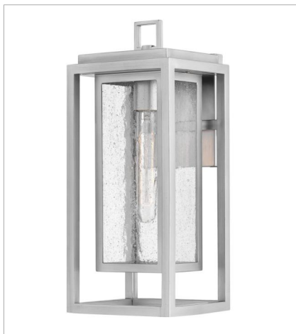
1004SI-LV MEDIUM WALL MOUNT LANTERN 12V 7" W, 16" H Socketed