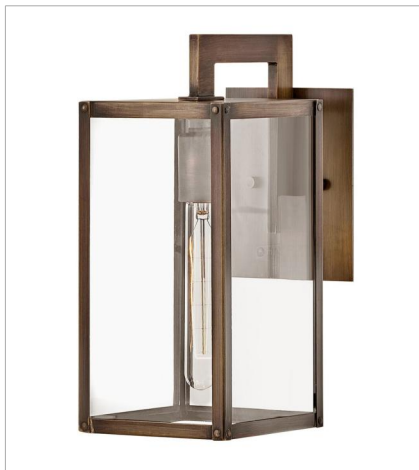
2590BU SMALL WALL MOUNT LANTERN 6" W, 13.3" H Socketed 1-12w Med. LED, 100w Equiv.

FINISH: Burnished Bronze GLASS: Clear, Clear and Etched White (optional)