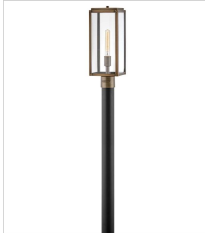
2591BU MEDIUM POST TOP OR PIER MOUNT LANTERN 7" W, 18.5" H Socketed 1-12w Med. LED, 100w Equiv.