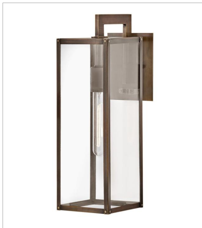
2594BU MEDIUM WALL MOUNT LANTERN 6" W, 18.5" H Socketed 1-12w Med. LED, 100w Equiv.