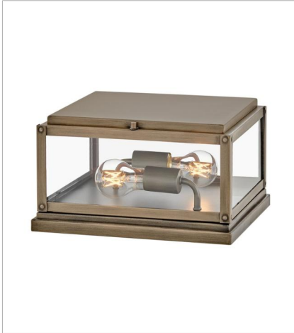
28858BU-LV SMALL PIER MOUNT LANTERN 12" W, 7.5" H Socketed 2-8w Med. LED *Included

FINISH: Burnished Bronze GLASS: Clear, Clear and Etched White (optional)