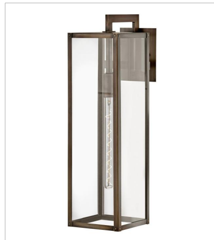
2595BU LARGE WALL MOUNT LANTERN 7" W, 25" H Socketed 1-12w Med. LED, 100w Equiv.