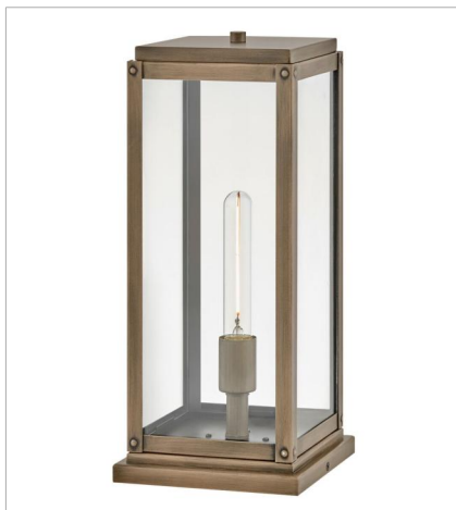
28857BU MEDIUM PIER MOUNT LANTERN 7.3" W, 17" H Socketed 1-8w Med. LED, 60w Equiv.