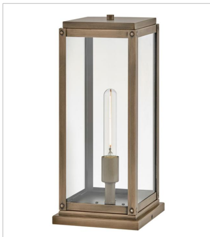
28857BU-LV MEDIUM PIER MOUNT LANTERN 7.3" W, 17" H Socketed 1-8w Med. LED *Included