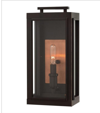
29100Z-LL SMALL WALL MOUNT LANTERN 7" W, 14" H Socketed 1-2w Cand. LED *Included