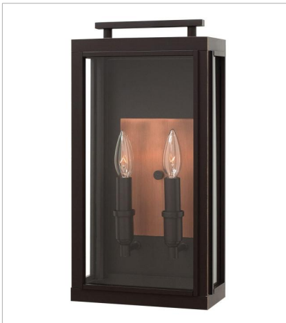
29140Z-LL MEDIUM WALL MOUNT LANTERN 9" W, 17" H Socketed 2-2w Cand. LED *Included