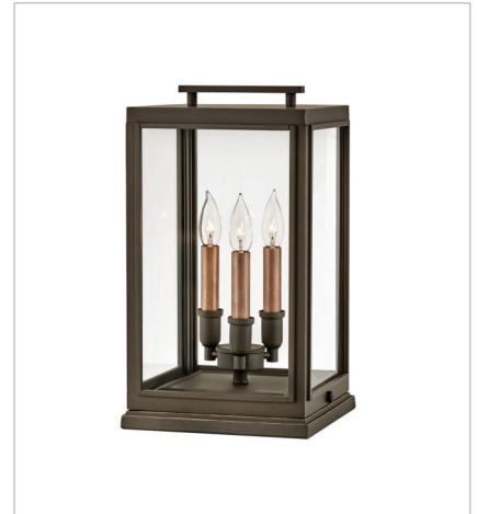
2917OZ-LV MEDIUM PIER MOUNT LANTERN 10.3" W, 18" H Socketed 3-3.50w Cand. LED *Included