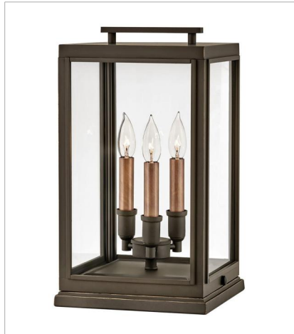
2917OZ-LL MEDIUM PIER MOUNT LANTERN 10.3" W, 18" H Socketed 3-2w Cand. LED *Included