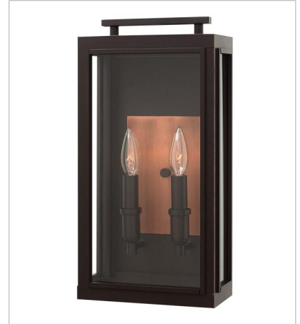
29140Z MEDIUM WALL MOUNT LANTERN 9" W, 17" H Socketed 2-5w Cand. LED, 60w Equiv.