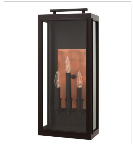
29150Z-LL LARGE WALL MOUNT LANTERN 10" W, 22" H Socketed 3-2w Cand. LED *Included