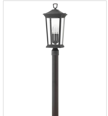
2361MB-LV LARGE POST TOP OR PIER MOUN... 10" W, 22.8" H Socketed 3-3.50w Cand. LED *Included