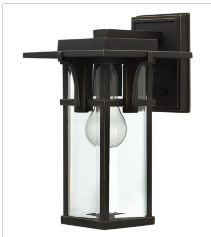
2320OZ SMALL WALL MOUNT LANTERN 7.3" W, 11.8" H Socketed 1-12w Med. LED, 100w Equiv.