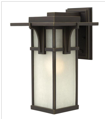
2234OZ MEDIUM WALL MOUNT LANTERN 9.3" W, 15" H Socketed 1-12w Med. LED, 100w Equiv.