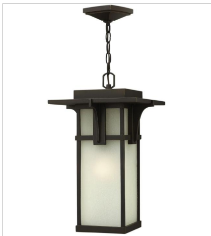
2232OZ LARGE HANGING LANTERN 11.3" W, 19.3" H Socketed 1-12w Med. LED, 100w Equiv.