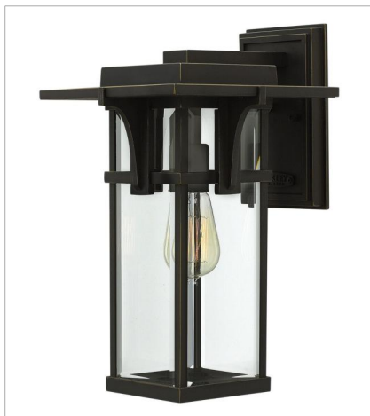
2324OZ MEDIUM WALL MOUNT LANTERN 9.3" W, 15" H Socketed 1-12w Med. LED, 100w Equiv.