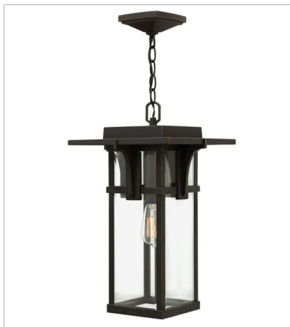
2322OZ LARGE HANGING LANTERN 11.3" W, 19.3" H Socketed 1-12w Med. LED, 100w Equiv.