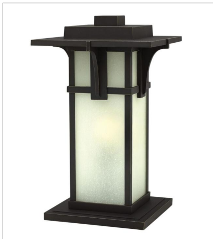
2237OZ LARGE PIER MOUNT LANTERN 11.3" W, 18.3" H Socketed 1-12w Med. LED, 100w Equiv.

FINISH: Oil Rubbed Bronze GLASS: Etched Seedy, Clear Beveled