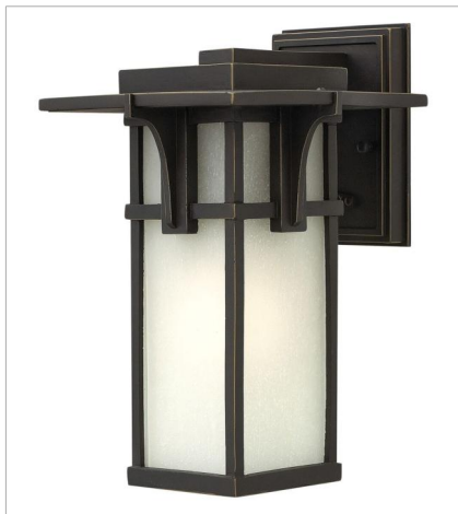
2230OZ SMALL WALL MOUNT LANTERN 7.3" W, 11.8" H Socketed 1-12w Med. LED, 100w Equiv.

FINISH: Oil Rubbed Bronze GLASS: Etched Seedy, Clear Beveled