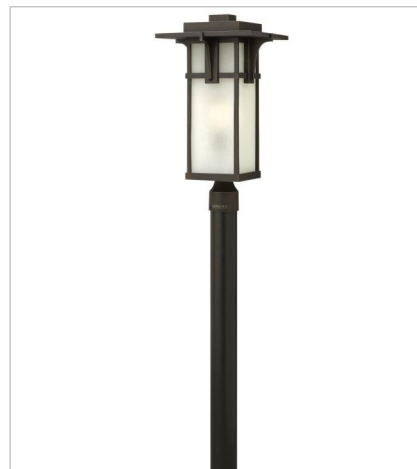
2231OZ LARGE POST TOP OR PIER MOUN... 11.3" W, 21.5" H Socketed 1-12w Med. LED, 100w Equiv.