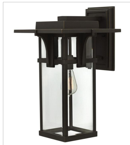
2325OZ LARGE WALL MOUNT LANTERN 11.3" W, 18.5" H Socketed 1-12w Med. LED, 100w Equiv.