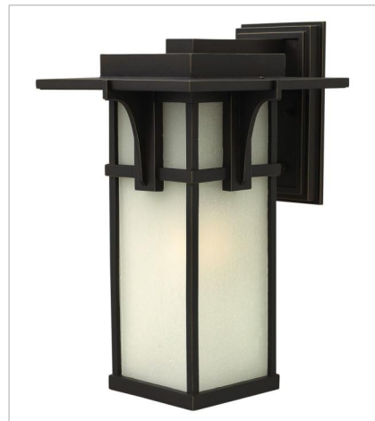
2235OZ LARGE WALL MOUNT LANTERN 11.3" W, 18.5" H Socketed 1-12w Med. LED, 100w Equiv.