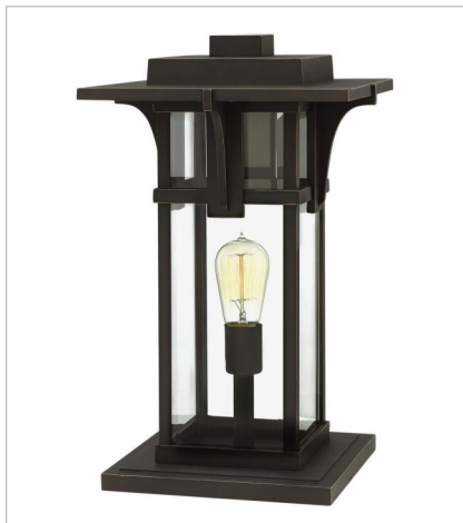
2327OZ LARGE PIER MOUNT LANTERN 11.3" W, 18.3" H Socketed 1-12w Med. LED, 100w Equiv.