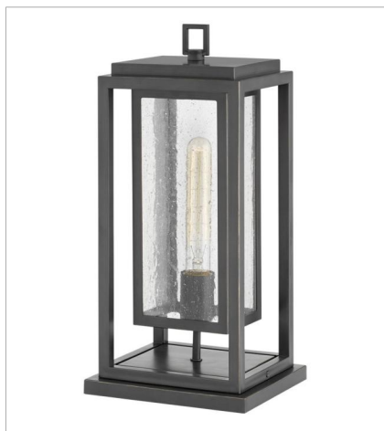
1007OZ MEDIUM PIER MOUNT 7" W, 16.5" H Socketed 1-12w Med. LED, 100W Equiv.

FINISH: Oil Rubbed Bronze GLASS: Clear Seedy