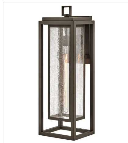
1009OZ LARGE WALL MOUNT LANTERN 9" W, 27" H Socketed 1-12w Med. LED, 100W Equiv.