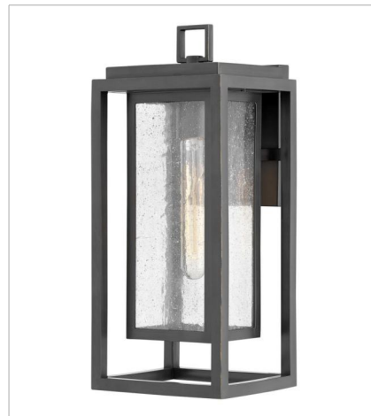
1004OZ MEDIUM WALL MOUNT LANTERN 7" W, 16" H Socketed 1-12w Med. LED, 100W Equiv.