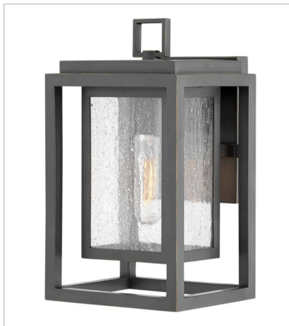
1000OZ SMALL WALL MOUNT LANTERN 7" W, 12" H Socketed 1-12w Med. LED, 100W Equiv.