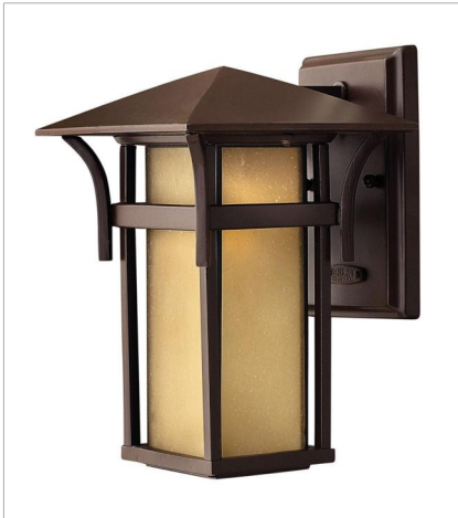
2570AR SMALL WALL MOUNT LANTERN 7" W, 10.5" H LED Lamp 1-10w Med. LED, 60w Equiv.

FINISH: Anchor Bronze GLASS: Etched Amber Seedy Bound