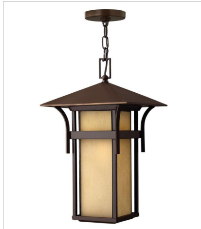
2572AR LARGE HANGING LANTERN 11" W, 19" H LED Lamp 1-12w Med. LED, 100W Equiv.