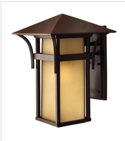
2575AR LARGE OUTDOOR WALL MOUNT LA... 11" W, 16.3" H LED Lamp 1-12w Med. LED, 100W Equiv.