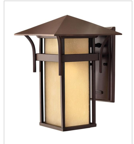
2574AR-LV MEDIUM WALL MOUNT LANTERN 12V 9" W, 13.5" H LED Lamp