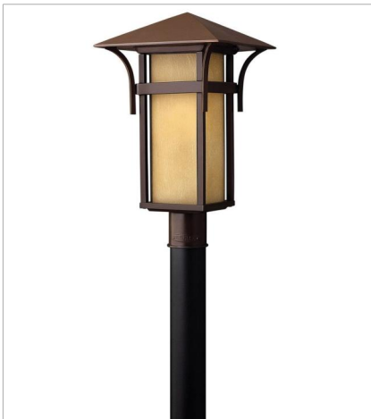
2571AR LARGE POST TOP OR PIER MOUN... 11" W, 19.5" H LED Lamp 1-12w Med. LED, 100W Equiv.