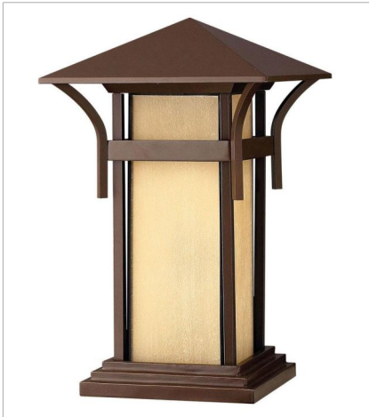
2576AR-LV LARGE PIER MOUNT LANTERN 12V 11" W, 17" H LED Lamp

FINISH: Anchor Bronze GLASS: Etched Amber Seedy Bound