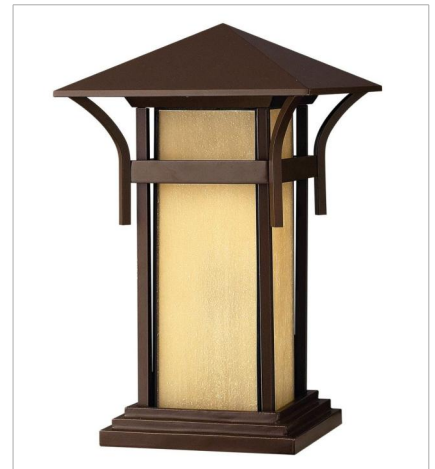
2576AR LARGE PIER MOUNT LANTERN 11" W, 17" H LED Lamp 1-12w Med. LED, 100W Equiv.