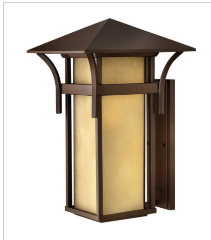
2579AR EXTRA LARGE WALL MOUNT LANTERN 13" W, 20.5" H LED Lamp 1-12w Med. LED, 100W Equiv.