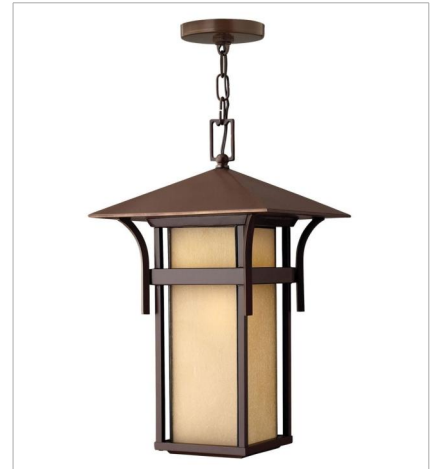
2572AR-LV LARGE HANGING LANTERN 12V 11" W, 19" H LED Lamp