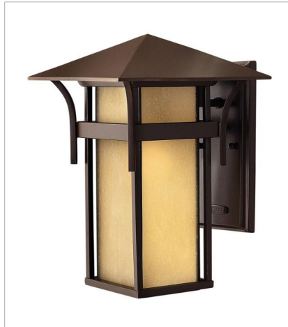
2574AR MEDIUM WALL MOUNT LANTERN 9" W, 13.5" H LED Lamp 1-12w Med. LED, 75w Equiv.